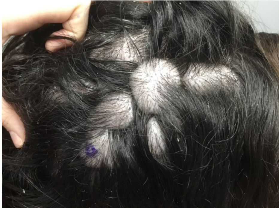
FIGURE 1: Prominent skin folds were noted on the right superior parietal scalp, left superior parietal scalp, right superior occipital scalp, and left superior occipital scalp with co-existing diffuse non-scarring hair loss distributed.

obtained for hematoxylin and eosin stain, which showed subtle, non-scarring, non-inflammatory alopecia, representative of telogen effluvium (Figure 2). No features of a deposition disorder were identified; however, there is background intradermal melanocytic nevus with congenital features (Figure 3). The patient described above was treated symptomatically with clobetasol 0.05% scalp solution twice a day for two weeks, biotin 5,000 µg daily, and tricommin shampoo without significant improvement. Additionally, she was counseled regarding surgical treatment options, as well as the literature-based risk of malignant transformation; the patient deferred all surgical options.