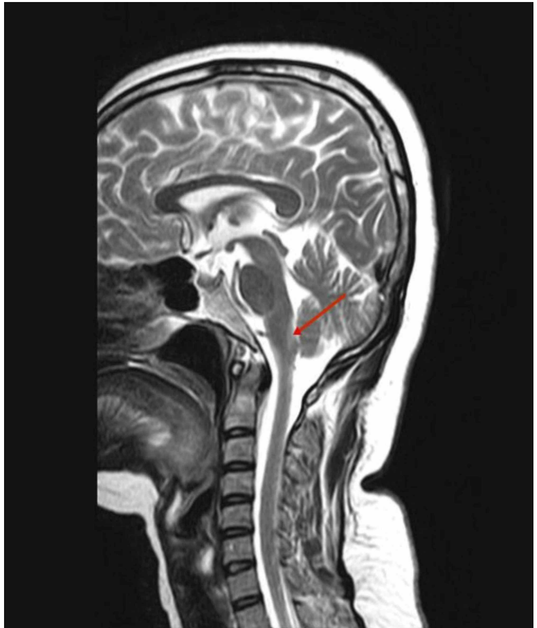
FIGURE 2: MRI spine showing an area of active demyelination in the periaqueductal region of dorsal medulla.

The patient was treated with intravenous methylprednisolone (IVMP) (500 mg, once a day) for five days. A decrease in symptoms was noted. At the time of discharge, the patient was stable and was advised to continue oral steroids for three weeks. Follow-up was advised for discussing tapering off of steroids and management with alternate immunosuppressive drugs.