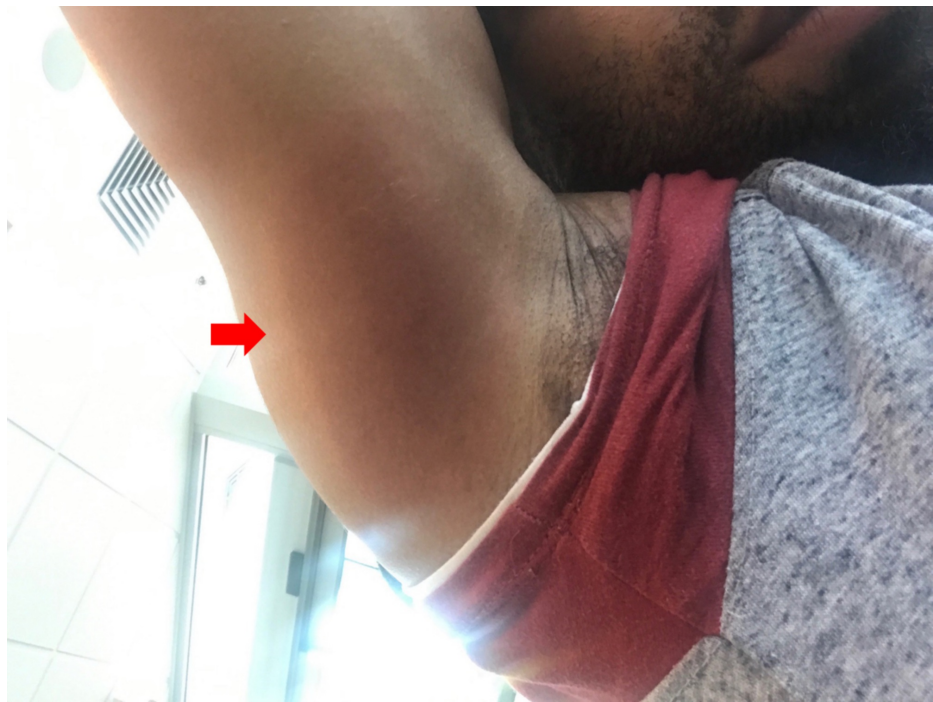
FIGURE 1: Erythema migrans (EM), right underarm

A 32-year-old African-American man initially presented for evaluation with a possible “bug bite” and an associated oval, red skin lesion on his posterior proximal arm, chills, and fatigue (Figure 1).