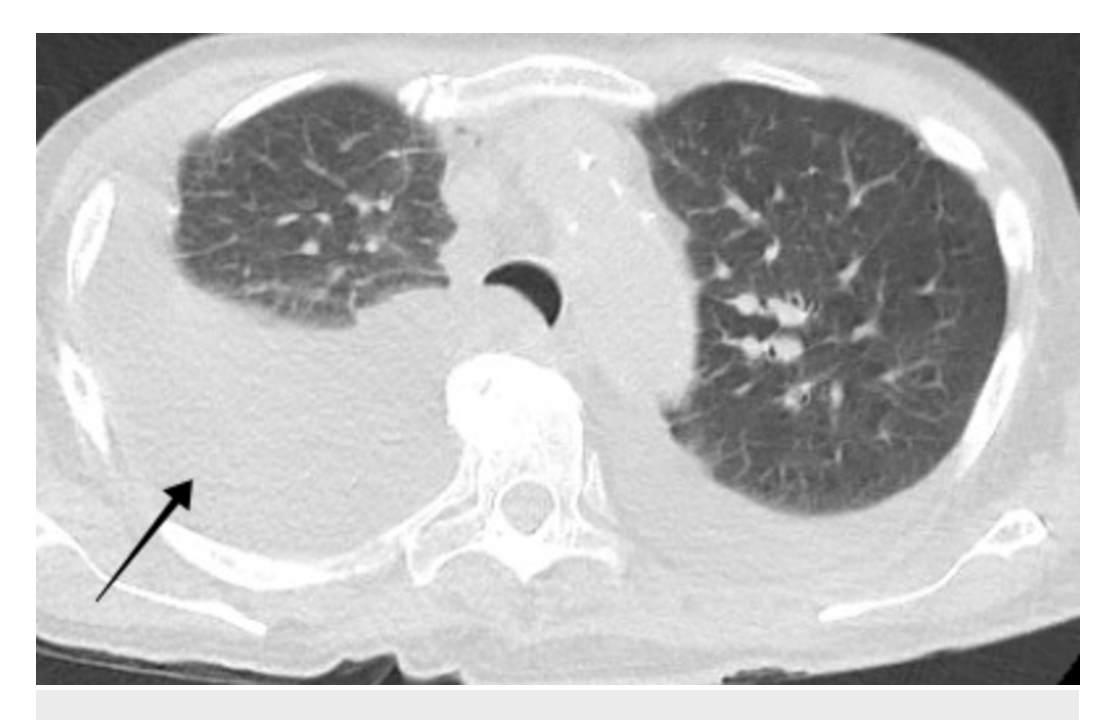
FIGURE 1: Computed tomography of the chest showed rightsided pleural effusion

A 75-year-old male presented to the emergency department with symptoms of dry cough, fatigue, decreased appetite, intermittent disorientation, and difficulty ambulating. He did not have complaints of fever, foul-smelling urine, hematuria, or abdominal pain. He had a history of mild aortic insufficiency with severe aortic stenosis and diastolic heart failure with an ejection fraction of 20%-25%. He was previously admitted for enterococcal endocarditis and was treated with intravenous (IV) antibiotics for a period of three months. He was scheduled to undergo transcatheter aortic valve replacement. For a period of one year, he used to selfcatheterize approximately four times a day due to urinary retention present due to a neurogenic bladder. On admission, his pulse was 99 beats per minute, blood pressure 104/68 mm of Hg, oxygen saturation of 99% on room air and respiratory rate 21 breaths per minute. On physical exam, he had dry mucous membranes, was lethargic, and had decreased urine volume but dark in color. Workup revealed platelet count 90 K/ul (normal: 140 - 366 K/ul), troponin I 0.06 ng/ml (0.0 - 0.05 ng/ml), brain natriuretic peptide 3620 pg/ml (0 - 100 pg/mL), lactic acid 2.3 mmol/l (0.5 - 1.9 mmol/l), bilirubin 3.3 mg/dl (0.3 - 1.0 mg/dl), glucose 116 mg/dl (65 - 99 mg/dl), creatinine 1.4 mg/dl (0.7 - 1.3 mg/dl), and blood urea nitrogen 44 mg/dl (7 - 25 mg/dl). Computed tomography of the chest showed right-sided pleural effusion (Figures 1-2).