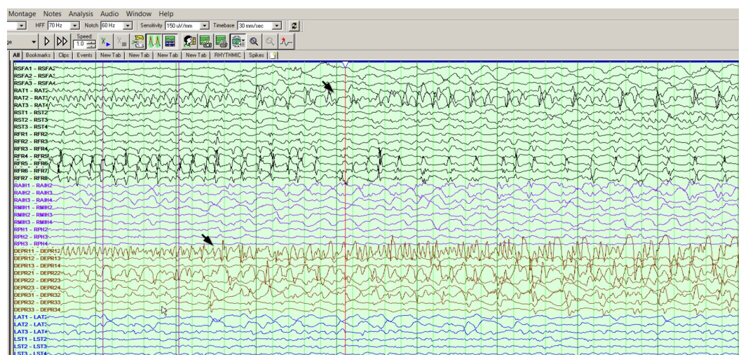
FIGURE 3: Secondary spread to the right hippocampal and