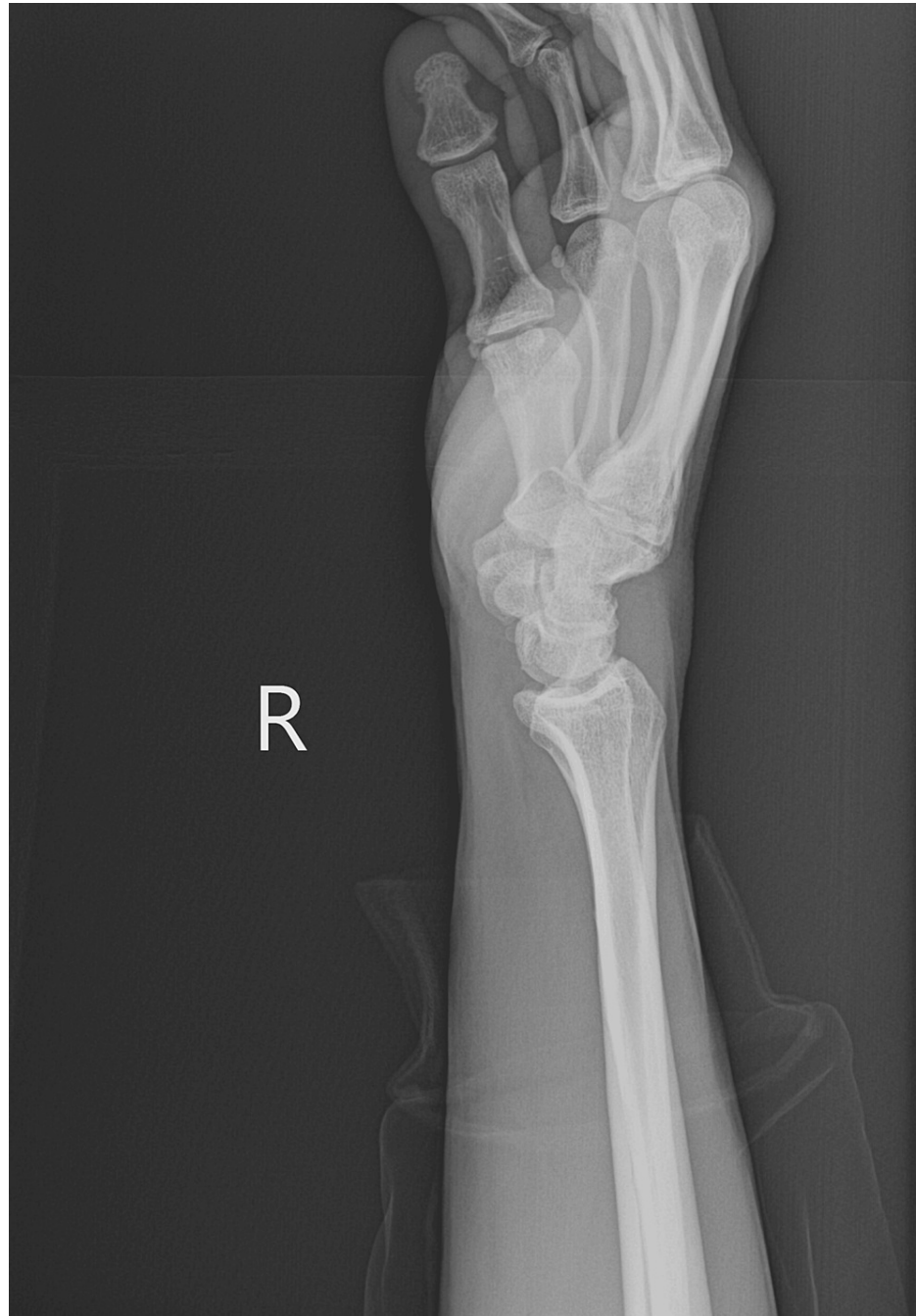
FIGURE 1: Lateral View Right Wrist X-ray

dissection, hemodynamically significant stenosis, or occlusion.