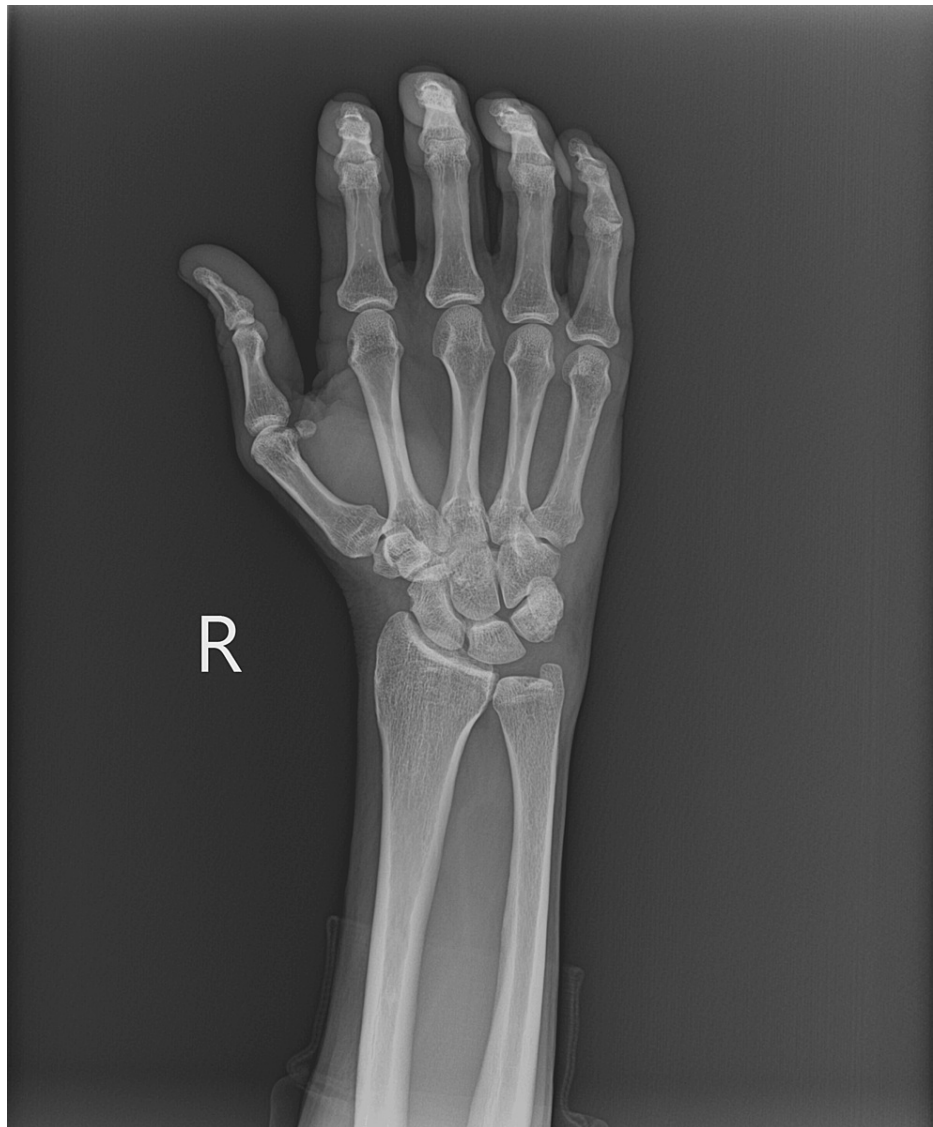
FIGURE 2: Posteroanterior View Right Wrist X-ray