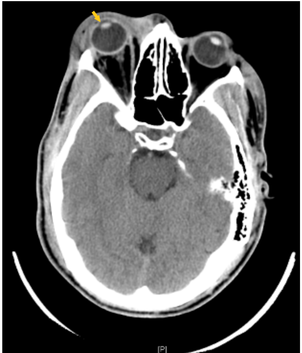
FIGURE 3: CT demonstrating right exophthalmos (arrow) with intraorbital fat stranding and abnormal caliber and density of the optic nerve sheath complex. Also seen is right preseptal subcutaneous soft tissue swelling and hematoma.

Upon talking with the transferring physician, we learned that the patient had nearly complete loss of vision in the affected eye. Knowing that orbital compartment syndrome can cause permanent ischemic changes as quickly as within 60 minutes of onset, my attending physician requested that a lateral canthotomy procedure be performed prior to transfer. We were able to walk the transferring physician through the procedure (Figure 4).