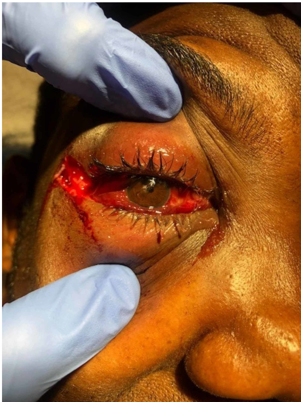
FIGURE 2: Patient with eye propped open by examiner

Computer Tomography (CT) scan of the head, orbits, and maxillofacial bones were obtained which revealed right exophthalmos with intraorbital fat stranding and abnormal caliber and density of the optic nerve sheath (Figure 3). The decision was made to transfer the patient to our facility for ophthalmology evaluation.