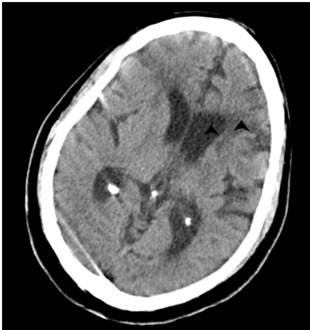
FIGURE 1: Non-contrast CT scan of the head showing enlarged left lateral ventricle and encephalomalacia in the left middle cerebral artery territory (black arrows).

A 59-year old male, with an unknown medical and psychiatric history, was brought to the emergency department (ED) by emergency medical service (EMS) after he was found wandering the streets and knocking randomly on people's doors. The patient presented with an altered mental status and was oriented to name only. The history obtained from him was poor and unreliable, given his confused, irrational speech and dysarthria. He gave a pharmacy location as his home address and was unclear about his past medical history. There was no alternative historian available for collateral information. He was subsequently admitted to the medicine service where he was evaluated by the neurology and psychiatry services, respectively. His head CT scan revealed encephalomalacia in the left middle cerebral artery territory suggestive of previous cerebrovascular disease (Figure 1).