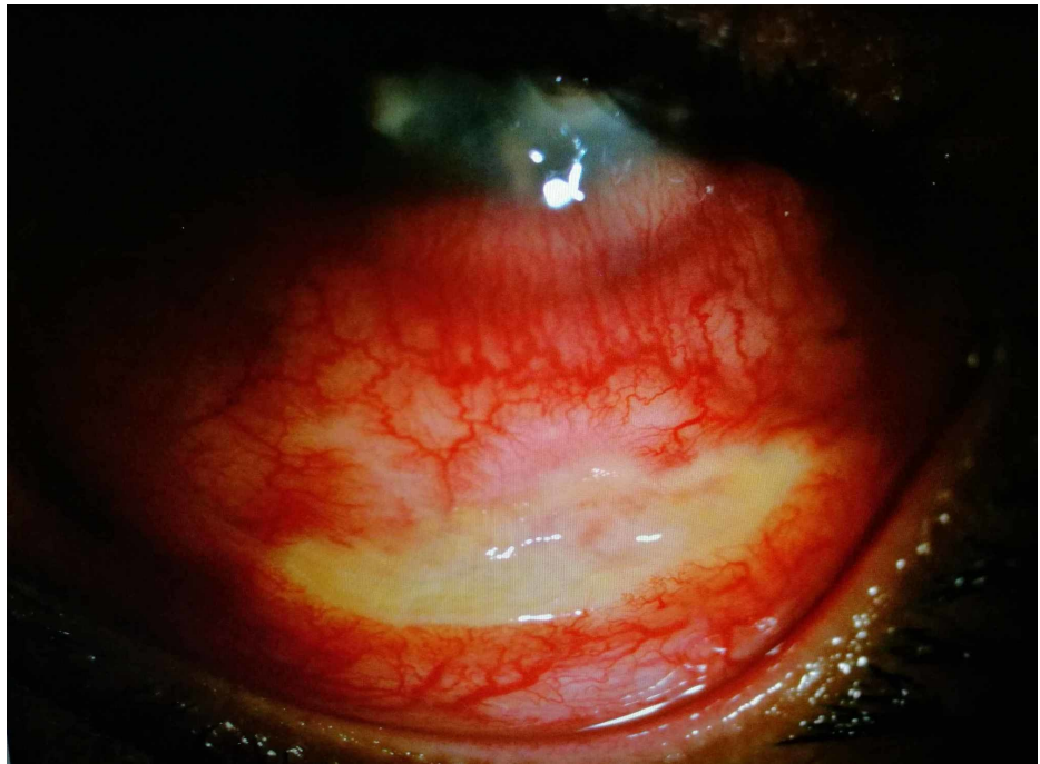
FIGURE 1: Slit lamp examination showed necrosis of inferior bulbar conjunctiva which corresponds to the site of injections. There was no scleral inflammation.

hospitalization. There was gradual improvement observed over three weeks where the base of the conjunctival necrosis appeared clean with evidence of scleral vascularization. Conjunctival epithelialization occurred from the edge of the surrounding healthy conjunctiva tissue. The conjunctival tissue was completely healed after three months along with the corneal ulcer.