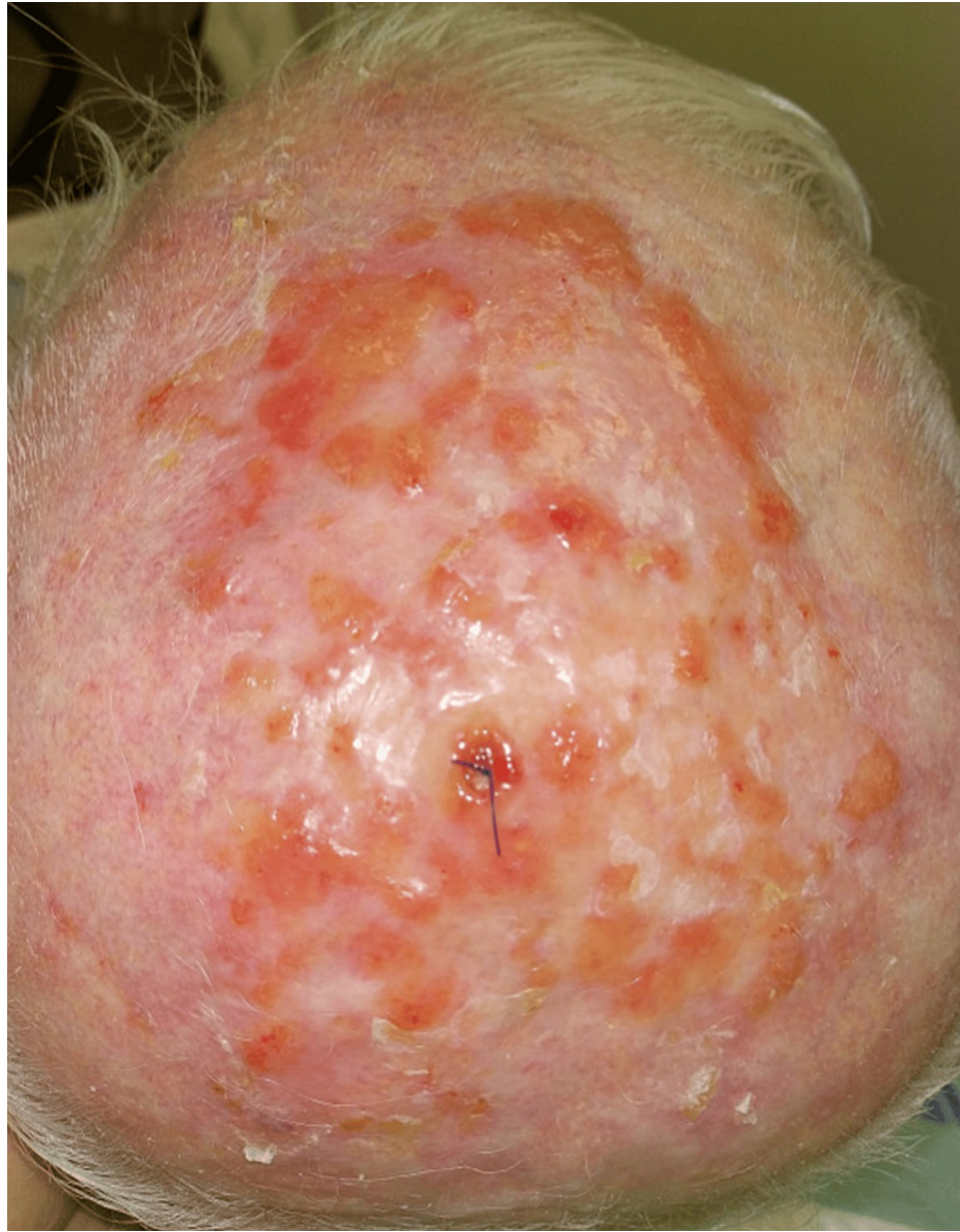
FIGURE 2: The condition of the scalp after cleaning.

The scalp was cleaned with Betadine and Dermacyn solutions. All crusts were removed.