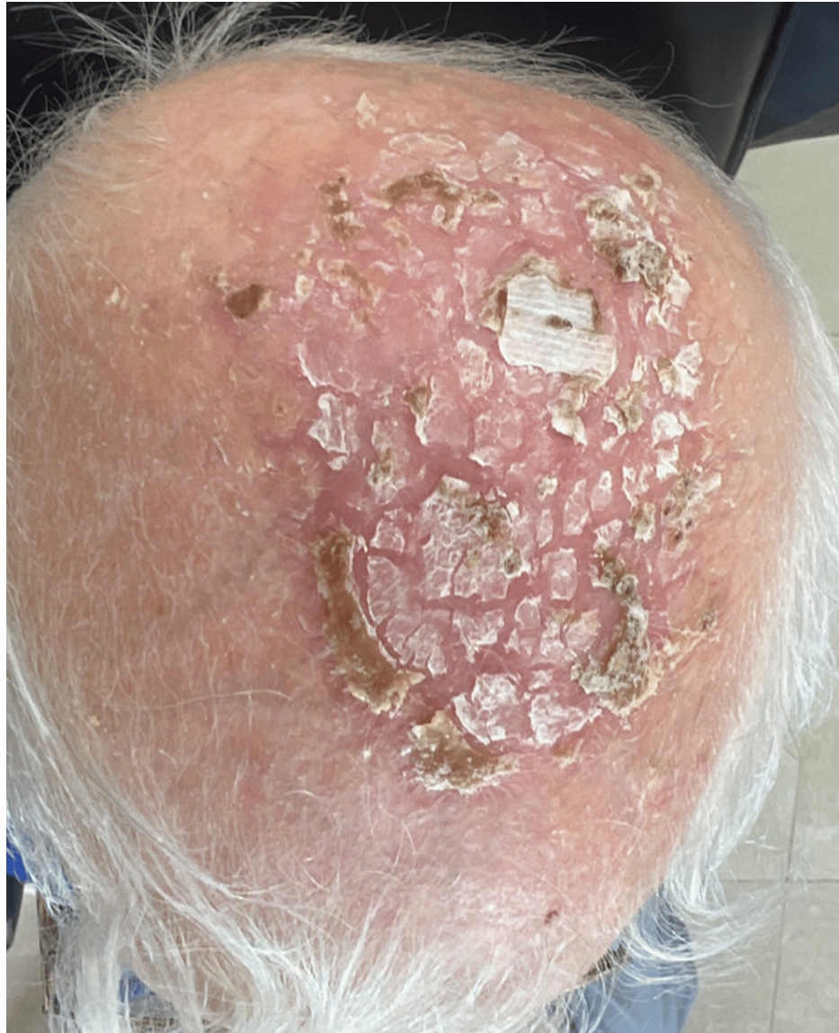
FIGURE 4: Two weeks of follow-up.

The figure shows the condition of the scalp after two weeks of presentation. The erosions and ulcers healed completely, and no new lesions formed on the scalp.