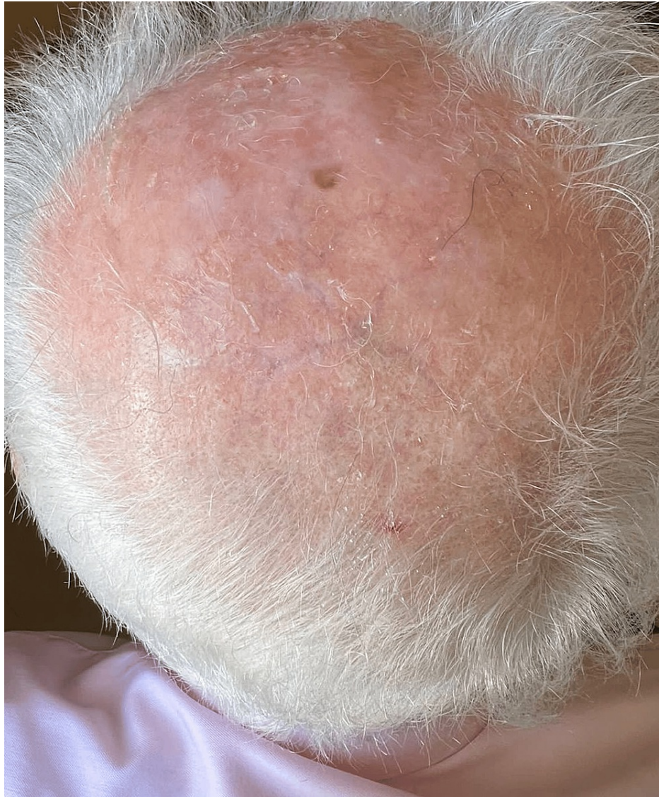
FIGURE 5: The condition of the scalp four months later.

The figure presents the condition of the scalp four months after treatment. The scalp is normal and shows no new lesions.