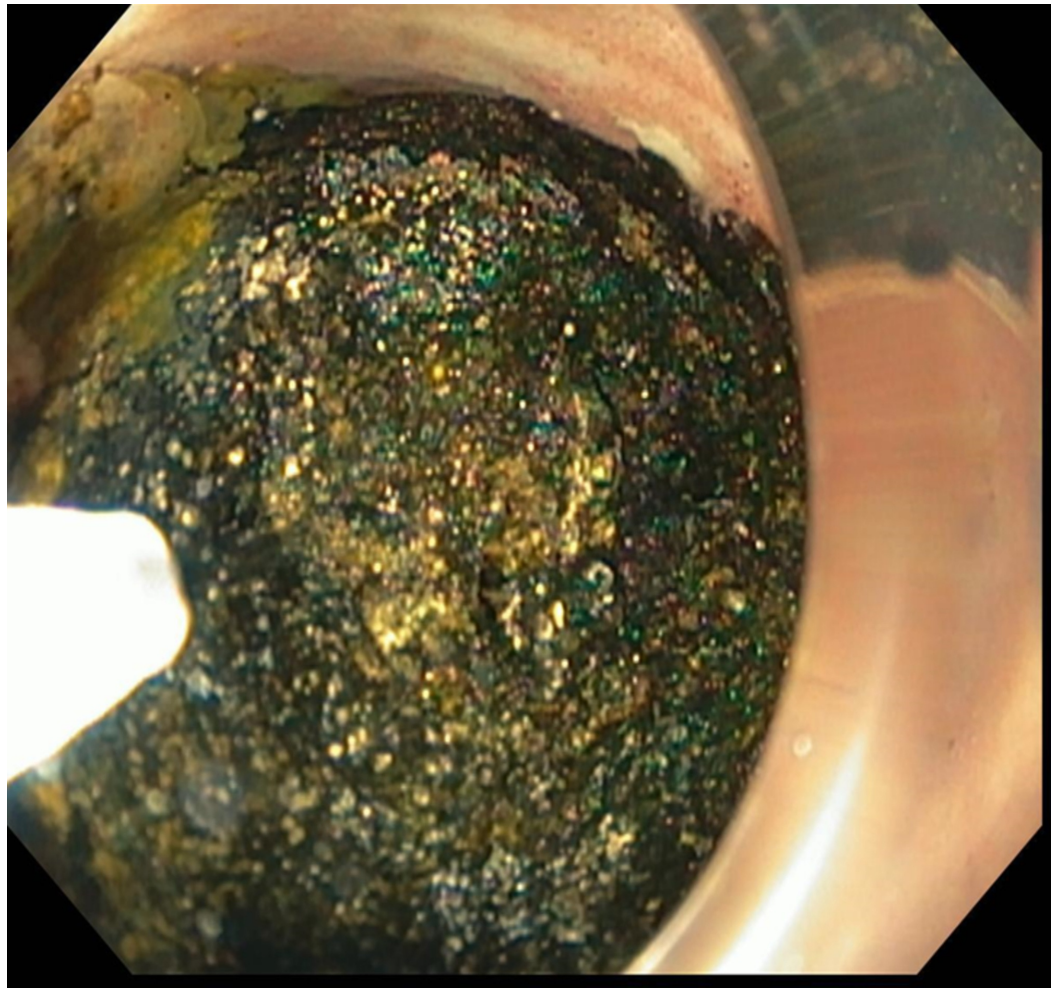
FIGURE 2: Upper endoscopy showed a large impacted stone in the second portion of the duodenum

Several endoscopic foreign body and stone retrieval devices, as well as lithotripsy, were attempted to remove or fragment the stone. However, the stone was impacted and exceedingly larger than the available endoscopic retrieval devices. Another attempt was made to inflate the controlled radial expansion (CRE) dilation balloon beyond the impacted stone and drag the stone into the stomach for fragmentation, but it was unsuccessful (Figure 3).