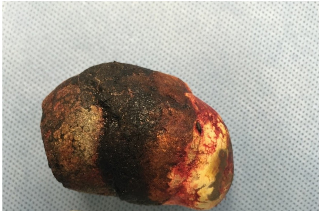
FIGURE 4: Gallstone removed by duodenotomy