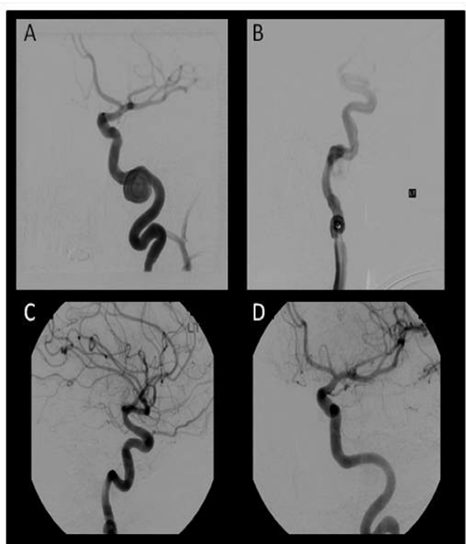
FIGURE 2: After placing the patient under general anesthesia with heparinization, a sub-selective catheterization of the cervical left internal carotid artery was performed using a right femoral puncture.

A) Pre-embolization diagnostic angiography re-demonstrating the area of dehiscence/pseudoaneurysm, which arose primarily from the horizontal left ICA-P segment. B) Occlusion after PED stent deployment, suggesting early blood flow redistribution and stasis within the lesion. C & D) Six month follow-up angiogram showing a widely patent stent with normal ICA-P vasculature.