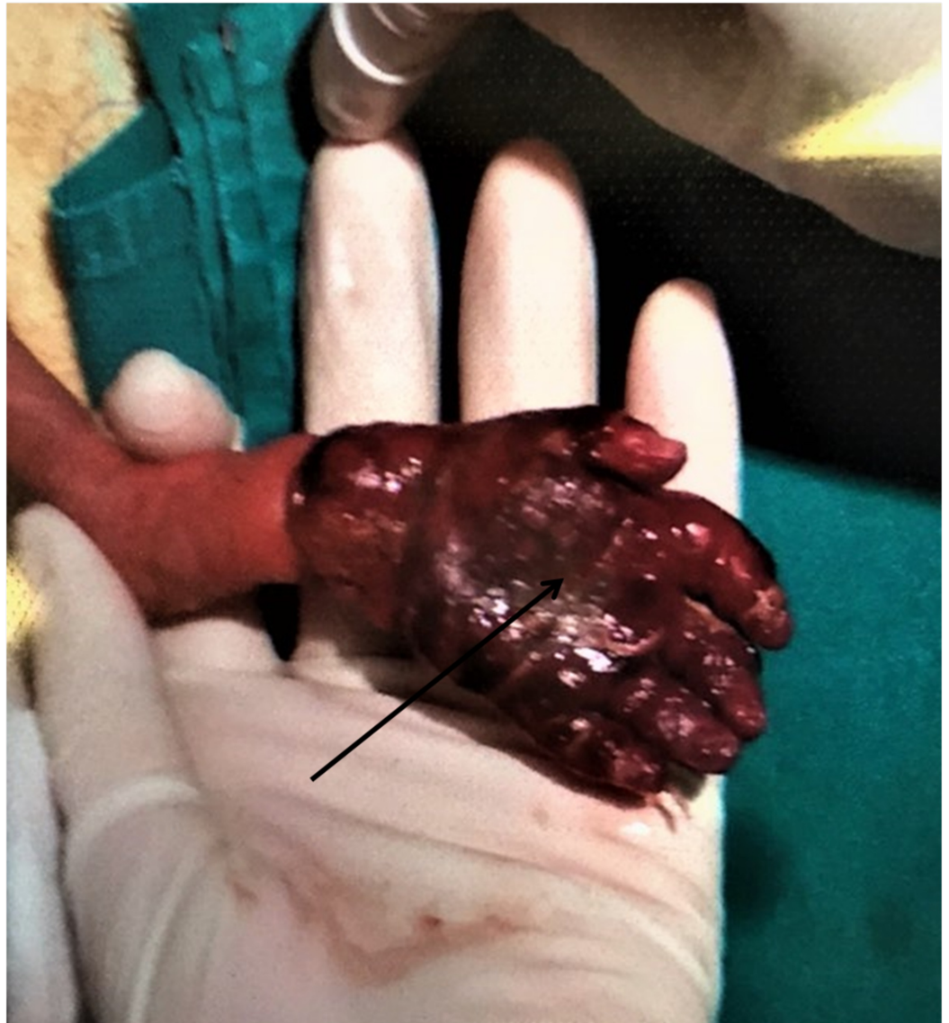
FIGURE 1: Severe swelling and vascular compromise of the hand, distal to the amniotic band.