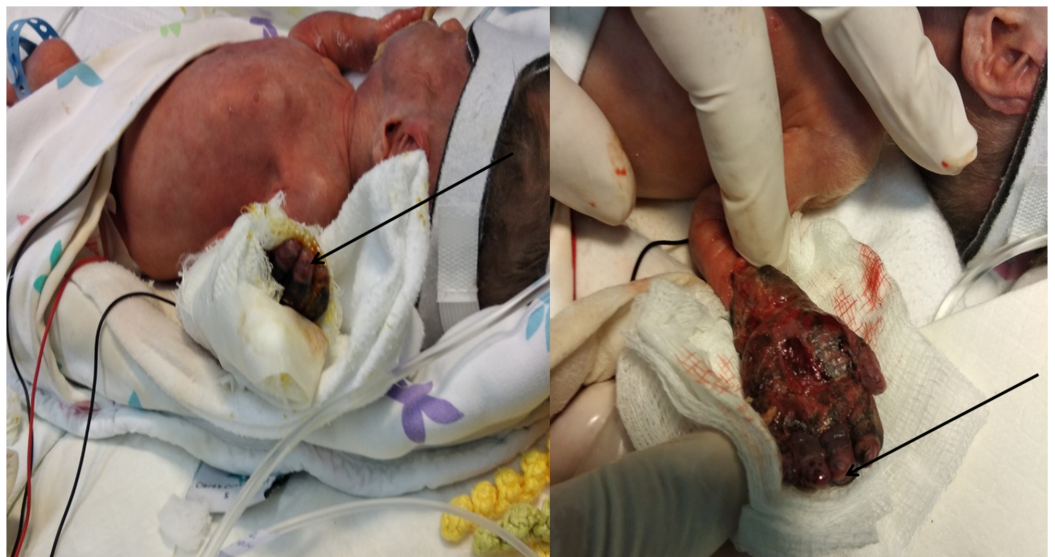
FIGURE 4: Compartment syndrome was gradually alleviated. Capillary refill and normal color of the fingertips (arrows) became evident during the next few days.