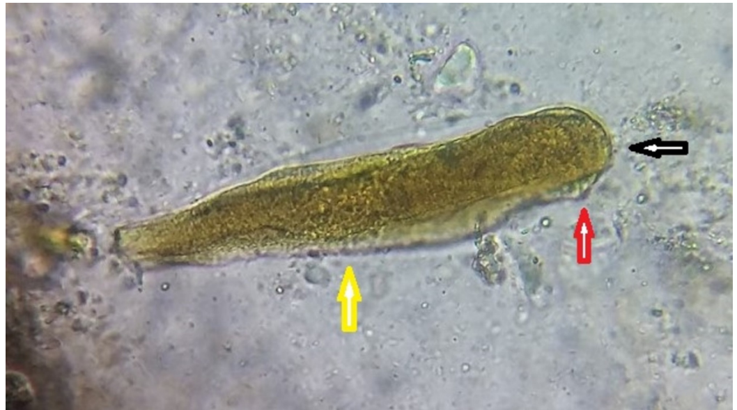
FIGURE 2: Direct stool wet mount showing the adult worm of Hymenolepis nana

The adult worm revealing the rostellum (black arrow), scolex (red arrow), and broader than long segments (yellow arrow)