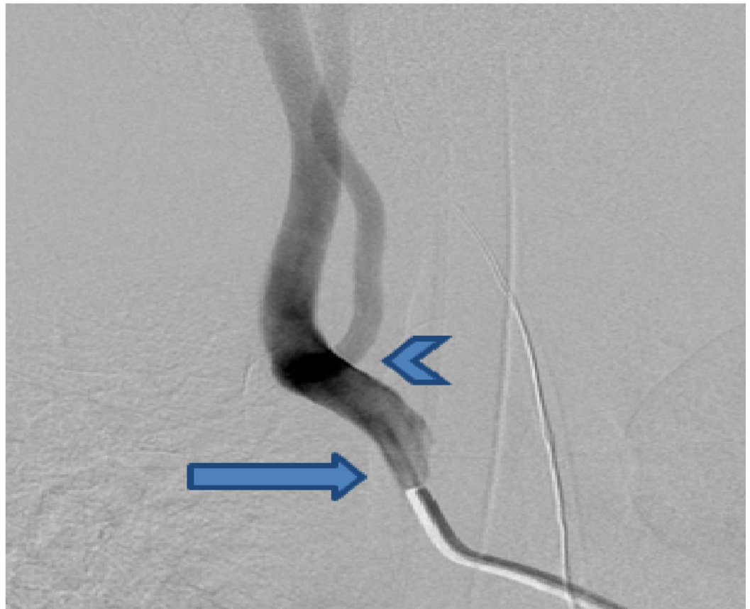
FIGURE 1: Right common carotid artery injection in the frontal view showing a direct origin of the right vertebral artery (arrowhead) just distal from the origin of the right common carotid artery (arrow)

the ICA aneurysms. Anteroposterior (AP) and lateral angiographic runs through the right common carotid artery showed a direct takeoff of the right VA just distal to the origin of RCCA (Figures 1-2), with the frontal view of the right subclavian artery roadmap showing an absence of the origin of the right VA from it (Figure 3). Although not documented on a dedicated aortic arch angiogram, this patient also had an aberrant right subclavian artery.