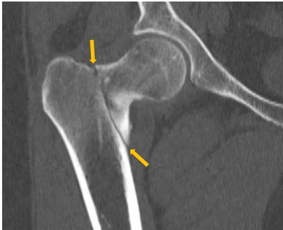
FIGURE 1: A CT scan showing the right intertrochanteric fracture of the right femur (yellow arrows)