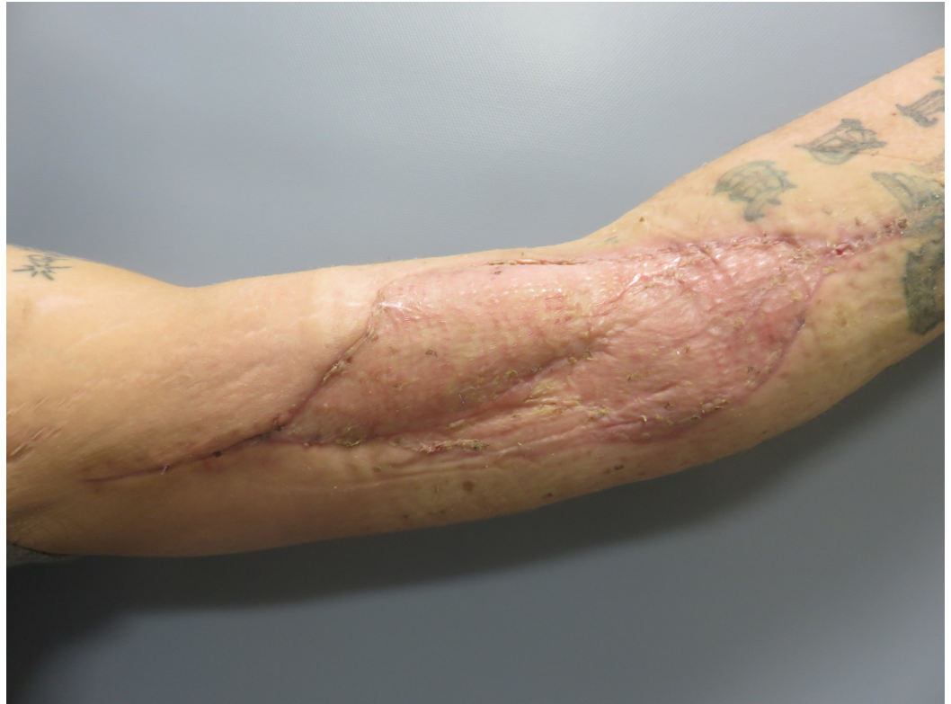
FIGURE 9: Following muscle transposition and skin graft.

NPWTi-d: negative pressure wound therapy with instillation and dwell time