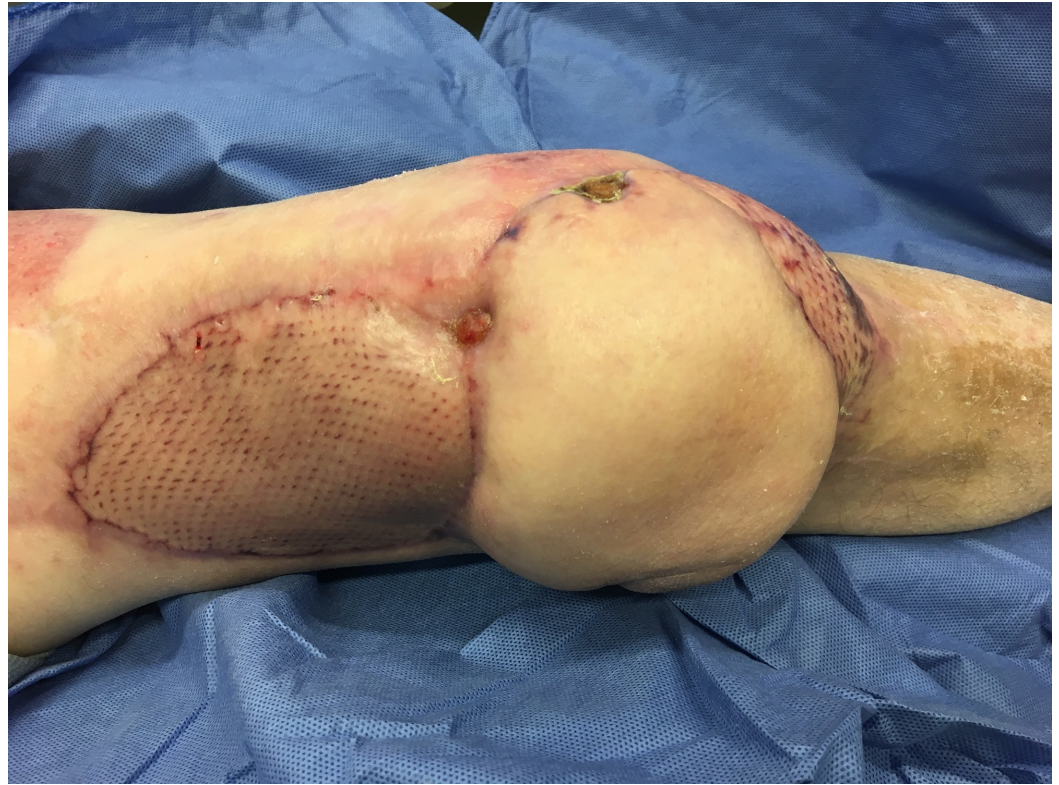
FIGURE 13: Following additional transposition and skin graft. The polyethylene components had been replaced and washed out.