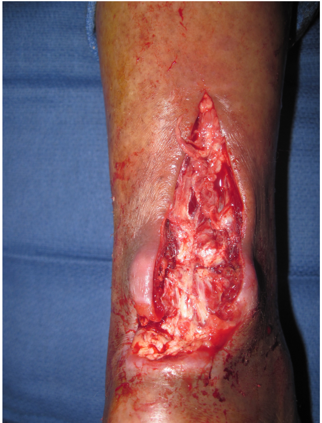
FIGURE 3: Following incision and drainage. Note the large area of destruction of portions of the Achilles tendon.