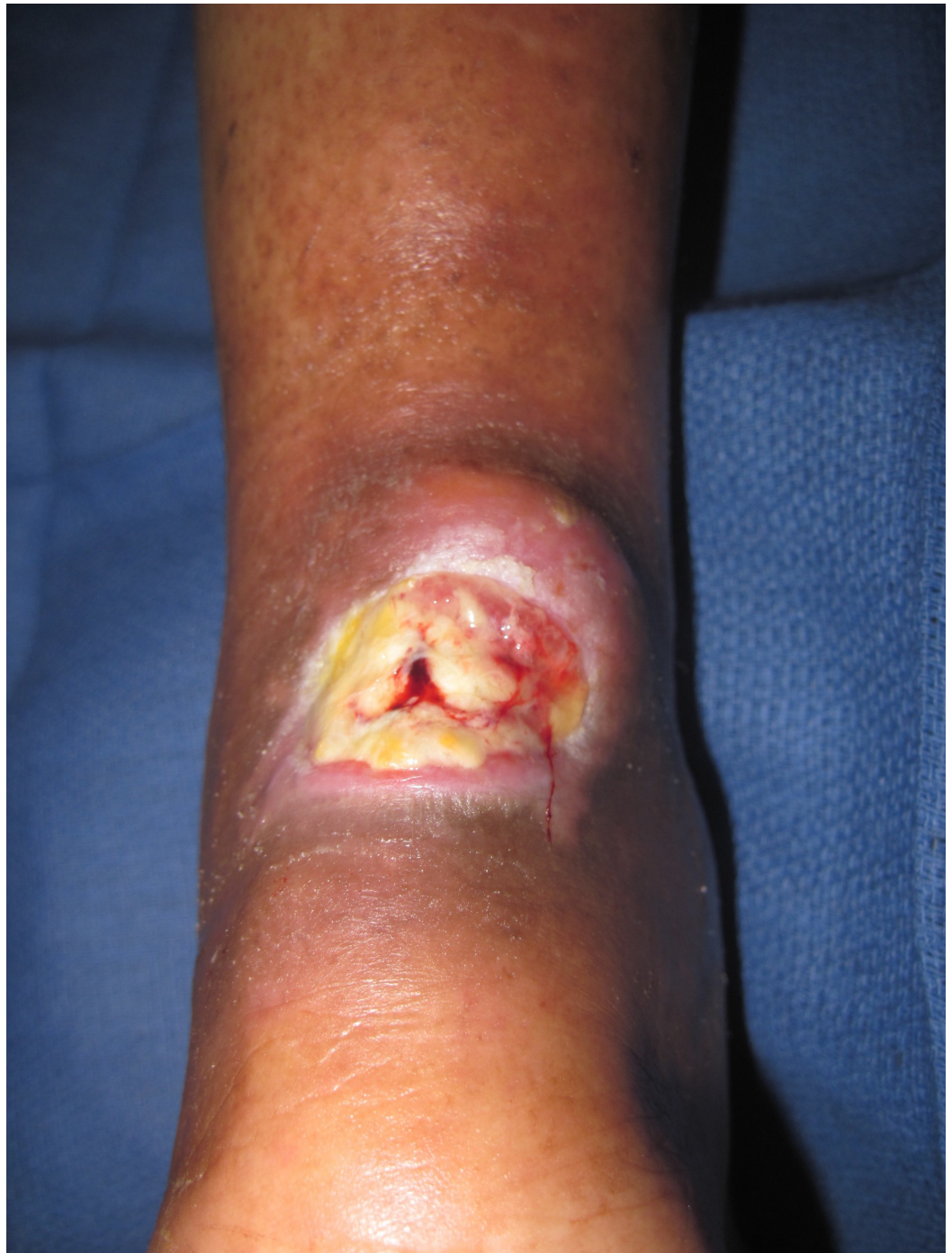
FIGURE 2: Chronic Achilles wound presents with fever and chills. Note the lack of inflammation over the posterior lower leg.