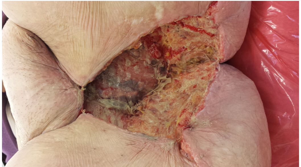
FIGURE 16: Following treatment with NPWTi-d with a V.A.C. VERAFLOR Cleanse Choice Dressing showing honeycomb areas of granulation tissue.

Also, note the progressive necrosis of the previously irradiated tissues at the wound edges that required subsequent debridements. This patient had substantial issues with both leakage and pain.