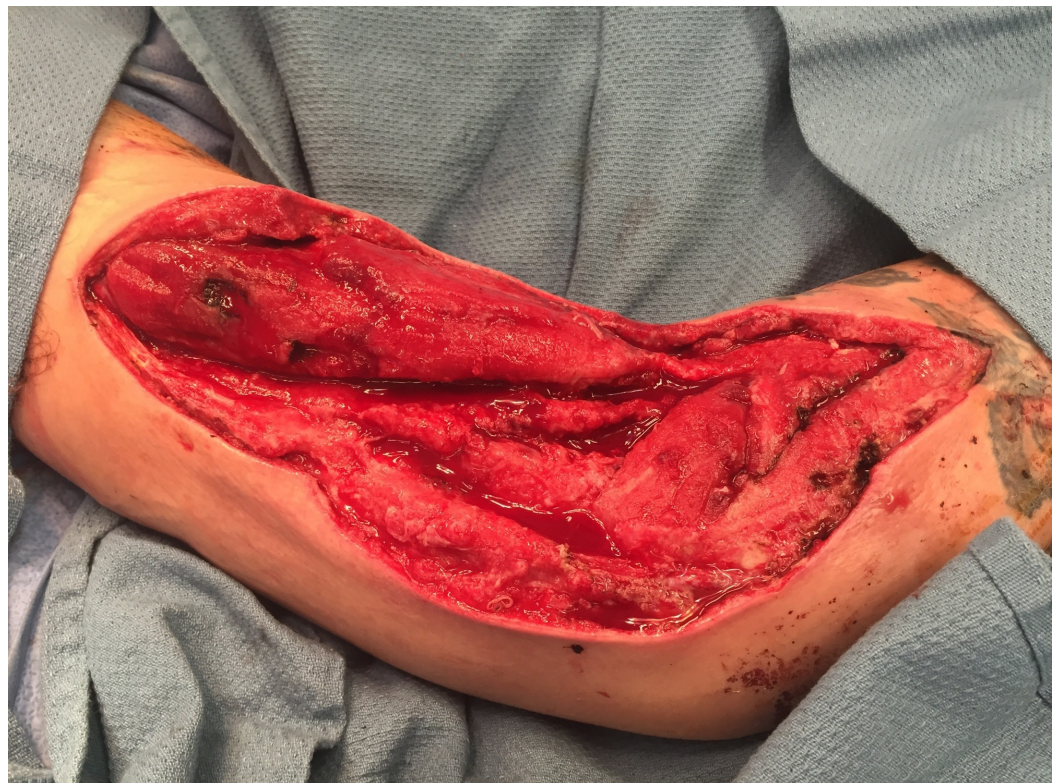
FIGURE 8: Following NPWTi-d. Note the robust granulation tissue.