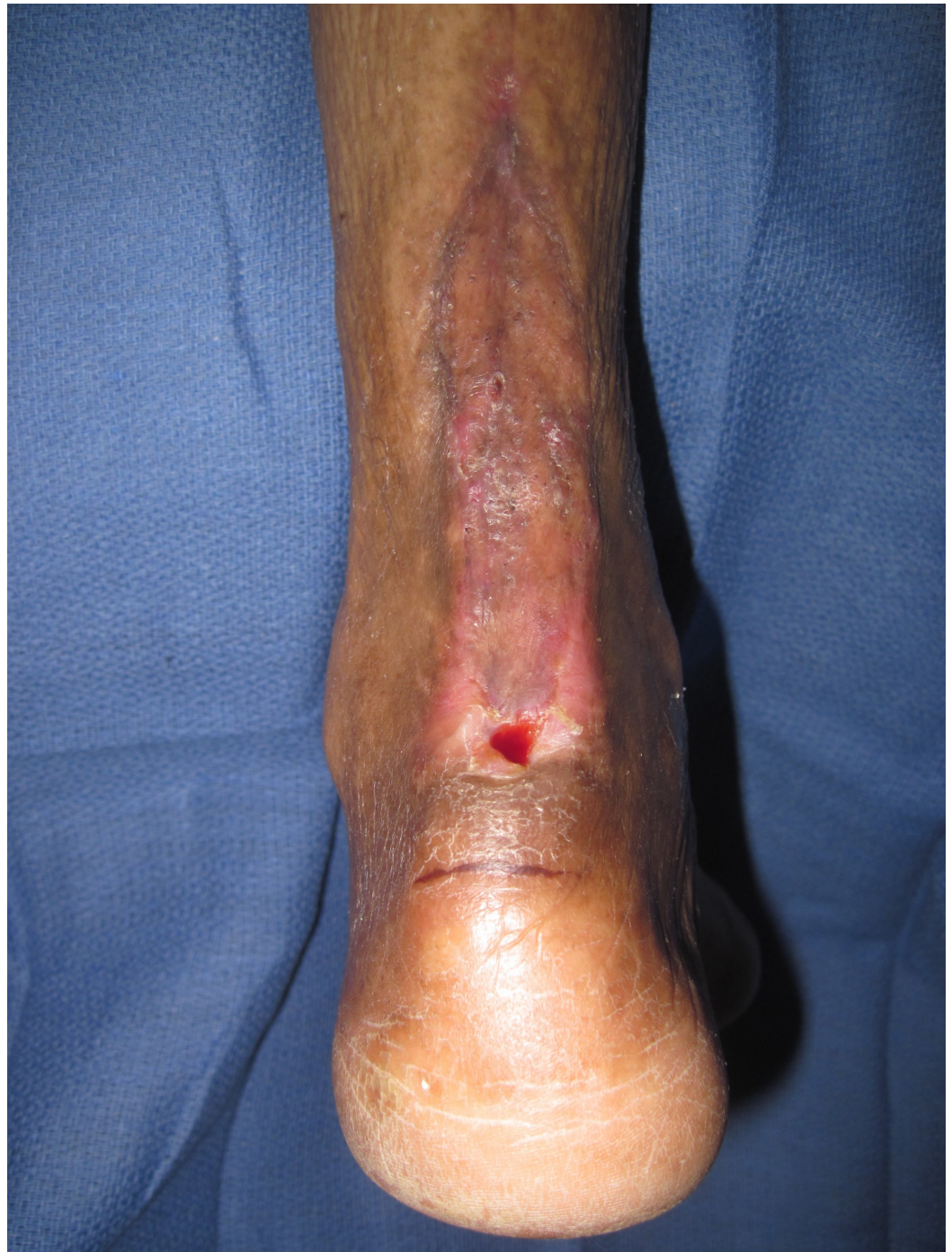
FIGURE 5: Two months after treatment.