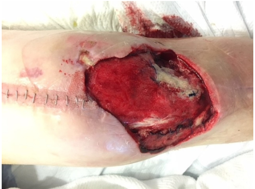
FIGURE 11: Following excision of necrotic skin and NPWTi-d. Note the rapid development of granulation tissue.

NPWTi-d: negative pressure wound therapy with instillation and dwell time