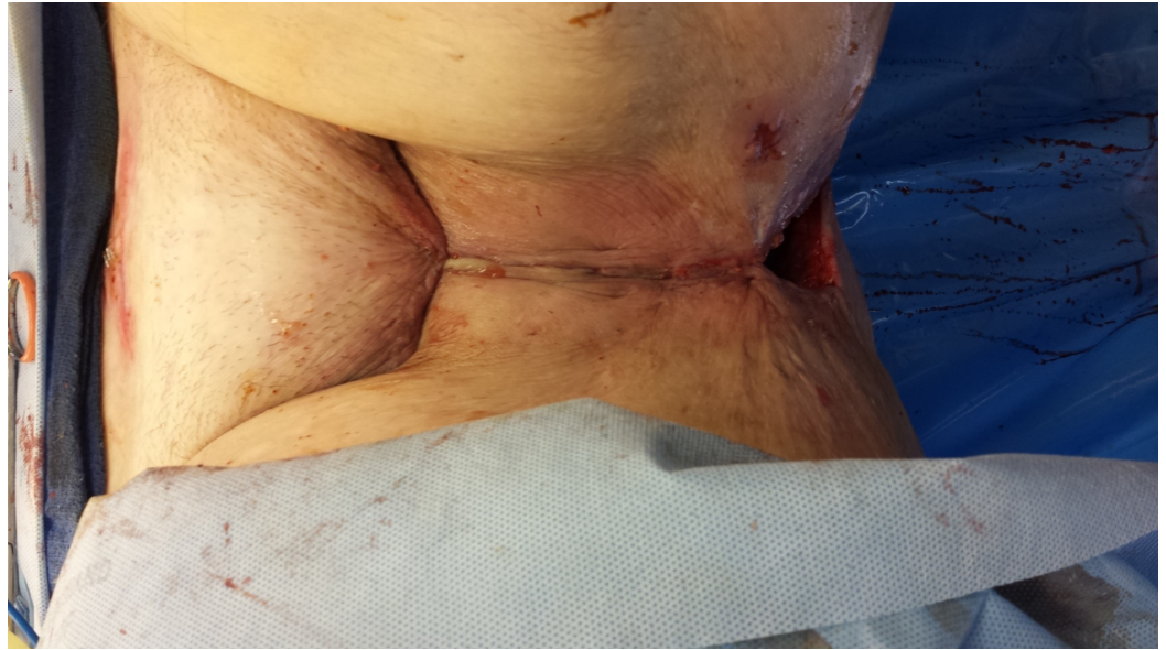
FIGURE 17: Following surgical closure of the defect.