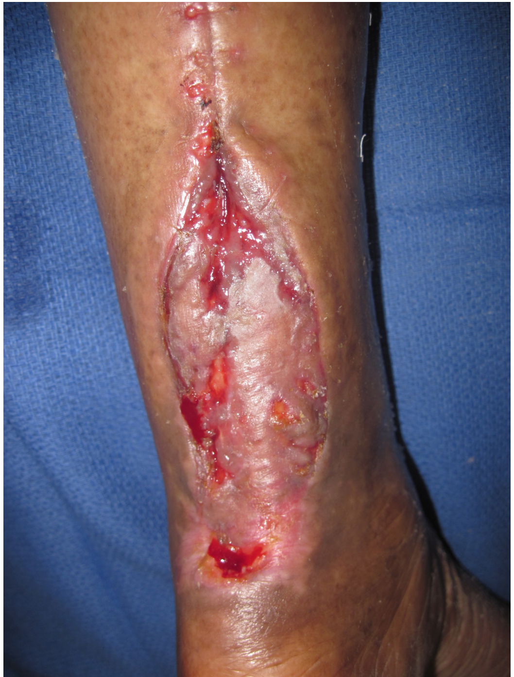
FIGURE 4: Treated with NPWTi-d and skin graft. Note a good skin graft has taken over much of the tendon.

NPWTi-d: negative pressure wound therapy with instillation and dwell time