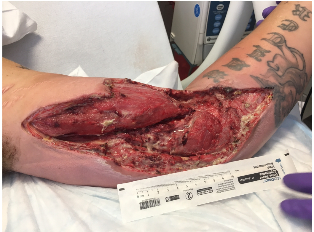
FIGURE 7: Following radical debridement. Note the substantial swelling of the extremity with exposure of the brachial vessels.