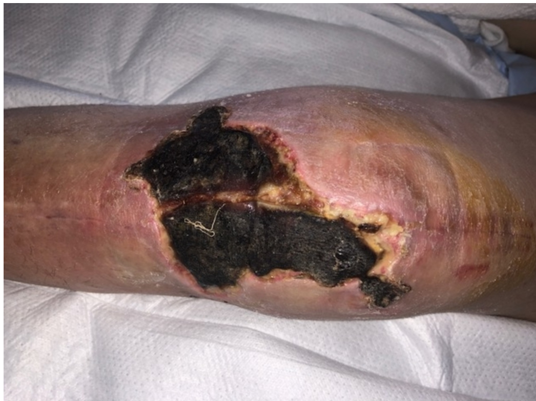
FIGURE 10: Infected total knee replacement in a patient with diabetes showing a large area of skin necrosis. The patient had undergone multiple previous surgeries on his knee.

placement. He developed an additional exposure of his patellar component that required removal, exchange of the polyethylene components, and re-transposition of the flap and skin grafts. Five months following his TKR, he remains in a post-acute care facility. He has a persistent sinus tract below the reconstruction with an otherwise closed wound and continues on suppressive antibiotics. This case illustrates the benefit of maintaining a moist wound, as well as the powerful pro-angiogenic role present with NPWTi-d device (Figures 10-13).