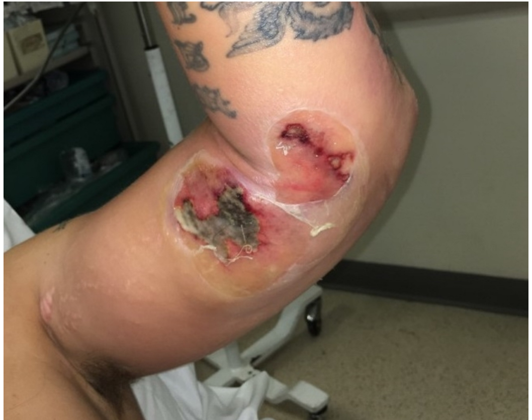
FIGURE 6: Necrotizing fasciitis of the elbow. Note blistering of the skin.

A 31-year-old male with poorly controlled type I diabetes mellitus and a history of intravenous drug abuse presented with a necrotizing soft tissue infection following an upper extremity trauma from a work injury. This was aggressively debrided, leaving him with a grossly swollen and inflamed extremity with a large open wound and exposed brachial vessels. A V.A.C. VERAFLOR TM device was placed with a double layer of Adaptic TM non-adhering dressing (Systagenix Wound Management, Acelity, San Antonio, TX ) covering the vessels. This was instilled with 40 cc of normal saline every two hours and allowed to dwell for 10 minutes. Three days later, he presented with massive bleeding for which he was emergently returned to the OR for a saphenous vein patch angioplasty, a biceps brachii muscle flap, a skin graft, and a conventional V.A.C. device. Three days later, he bled a second time requiring an additional saphenous vein patch angioplasty. Six weeks after the injury, his wound had closed and the inflammation had resolved. This case demonstrates how substantial inflammation resolves in association with the use of NPWTi-d (Figures 6-9).