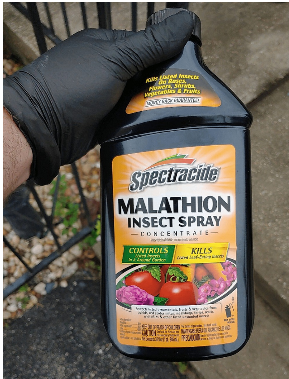
FIGURE 2: Insecticide ingested by the patient

Poison control was contacted immediately after suspicion arose of organophosphate poisoning. Atropine and pralidoxime (2-PAM) were given with a good response. Secretions and bradycardia improved, and miosis began to improve. However, a few hours later, the patient became symptomatic again and required multiple additional doses of atropine. At the recommendation of poison control, the patient was started on a continuous 2-PAM infusion for 12 hours. The patient stabilized on infusion and did not require additional doses of atropine overnight. The following day, after the 2-PAM infusion finished, the patient developed episodes of bradycardia with associated mild hypotension responsive to atropine. The patient gradually required less and less frequent dosing of atropine as he continued to clinically improve.