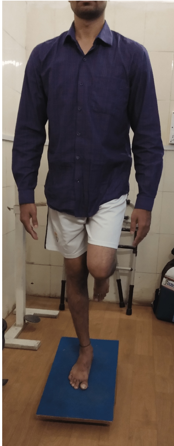
FIGURE 3: The proprioception training on the wobble board

The range of motion and manual muscle testing are given in the form of outcome measures before and after physiotherapy in Table 2, and other outcome measures are shown in Table 3.