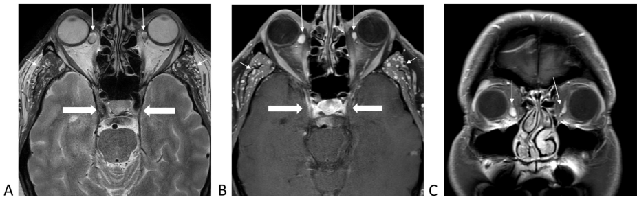
FIGURE 1: Magnetic resonance imaging of the brain demonstrating varices of inferior ophthalmic veins bilaterally (long arrows), infratemporal venous vessels (short arrows), and normal cavernous sinuses (thick arrows).

1A, axial T2-weighted without contrast. 1B, axial T1-weighted with contrast and fat saturation. 1C, coronal T1-weighted with contrast and fat saturation.