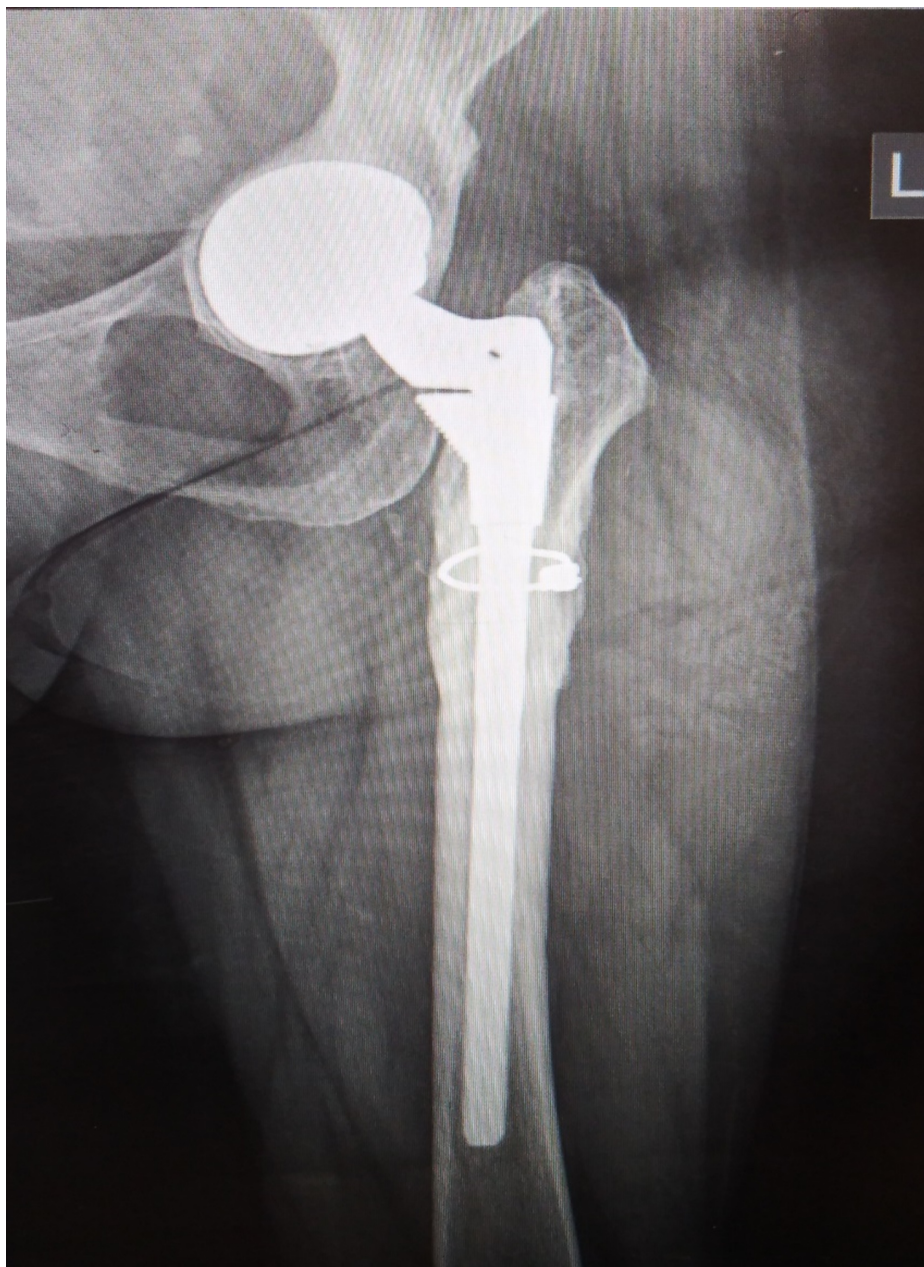
FIGURE 2: Post-operative X-ray