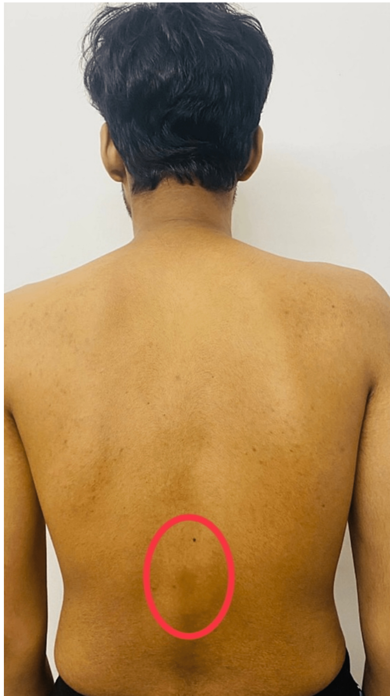
FIGURE 2: The image showcases the kyphotic deformity in the back