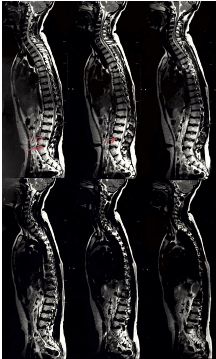
FIGURE 3: MRI showing the schmorl's nodules between the vertebral discs

These red arrows show the schmorl's nodules between the vertebral discs