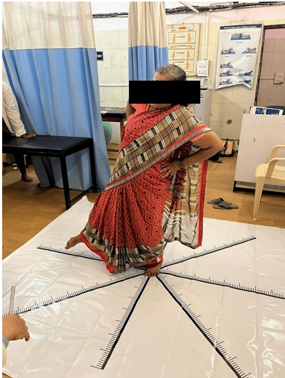
FIGURE 2: Star Excursion Balance Test

Patient reaching out in lateral direction with stance on unaffected left extremity