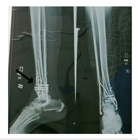
FIGURE 1: Post-operative X-ray of the right ankle in anteroposterior (AP) view and lateral view showing the trimalleolar fracture (black arrow) managed with open reduction and internal fixation using a rush nail and cannulated cancellous screw.

The radiological investigations were conducted post-operatively to view the fixation of the implants (Figure I).