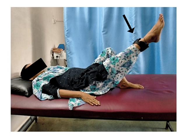
FIGURE 4: Strength training of hip flexors using a 1kg weight cuff

Hip muscle strengthening was done with a 1kg weight cuff. For hip flexors i.e., iliopsoas muscle, the patient was placed in a supine position (Figure 4), extensors i.e., gluteus Maximus were in a prone lying position (Figure 5), and abductors i.e., gluteus medius and minimus were in a side-lying position. Ten repetitions of each were given. Dynamic quadriceps strengthening was given in a high sitting position with a 1kg weight cuff 10 times. Strengthening of the dorsiflexors and plantar flexors was done using the resistance band, 10 times each. Progression was done to heel raise and toe raise in standing for 10 times.