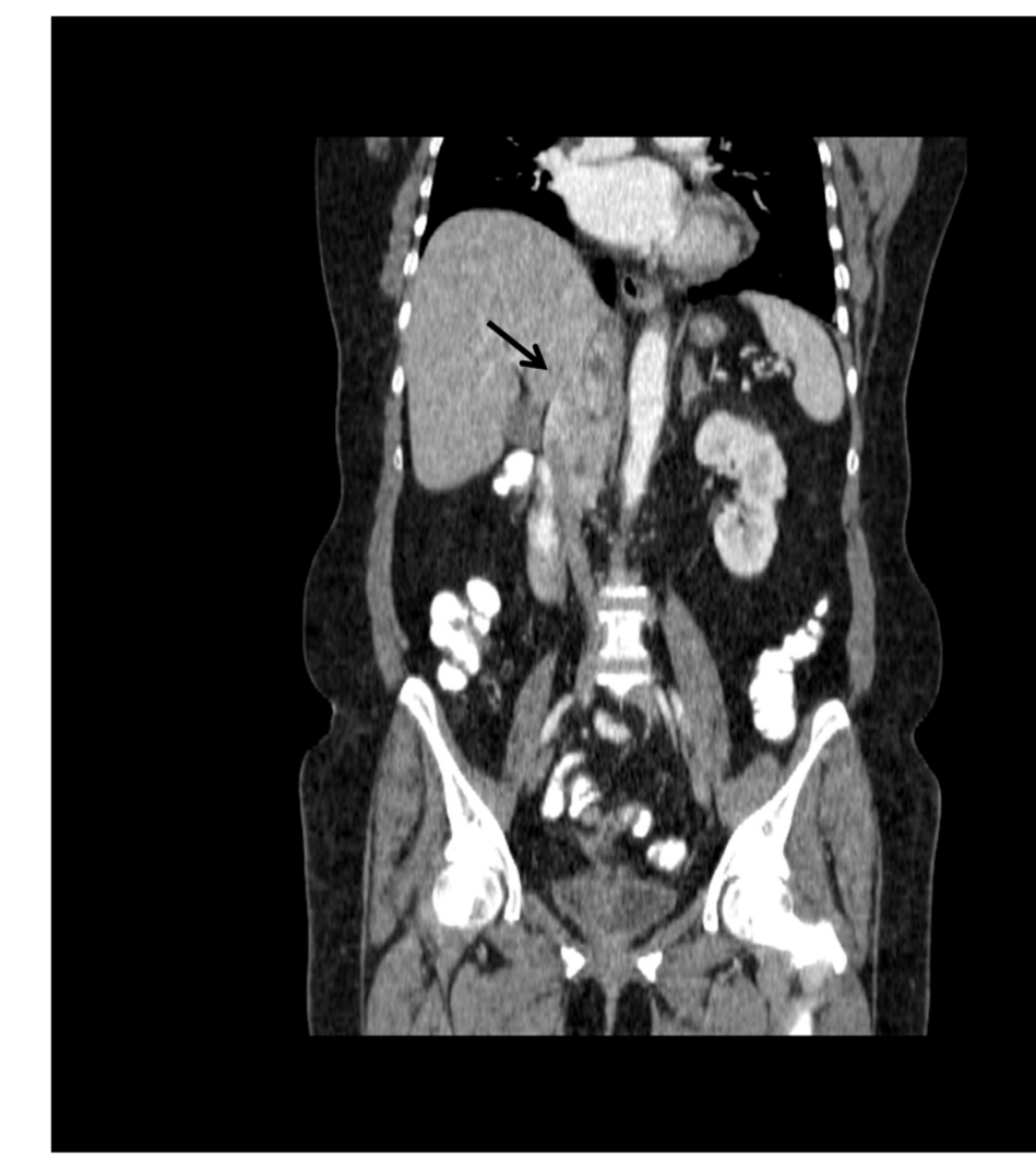
FIGURE 2: Right-sided 75 x 37 mm irregular and heterogeneous mass lesion extending inferiorly from the diaphragmatic crus level, invasive to vena cava inferior and right lobe of the liver (black arrow)

The lesion showed heterogeneous enhancement with occasional cystic necrotic areas and a calcified focus. It was observed that the mass was invasive to the vena cava inferior and showed nodular invasion approximately 1 cm in diameter in the subcapsular area in the inferior segment 6 level of the right lobe of the liver. The appearances that suggest the tumor thrombus is remarkable in the vena cava inferior. Metastasis was not detected in the patient's thorax computerized tomography scan.