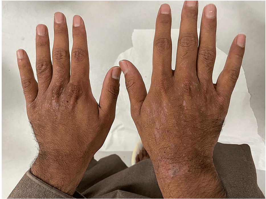
FIGURE 1: Multiple scaly, hyperkeratotic nodules and excoriations over the dorsal surface of both hands