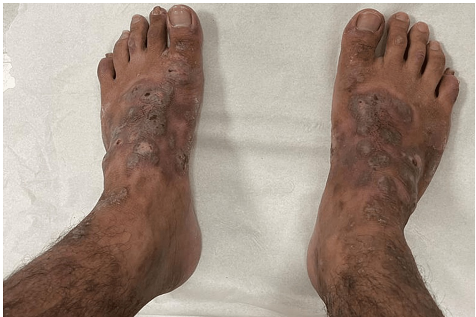
FIGURE 2: Multiple scaly, hyperkeratotic nodules and excoriations over the dorsal surface of feet