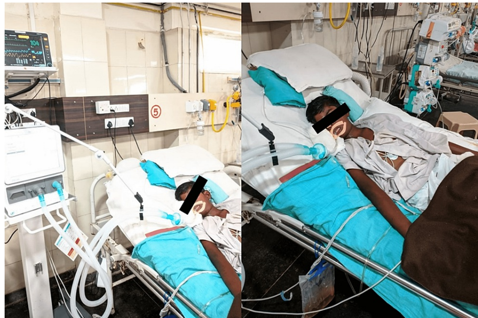
FIGURE 1: The patient on the day of assessment on a ventilator.

He presented with a poor Glasgow coma scale (GCS) with a score of 6/15 associated with an episode of desaturation, for which he was intubated with an endotracheal tube for one week. He was diagnosed with acute necrotizing encephalopathy on November 17, 2021. Given prolonged intubation for nine days, a tracheostomy was done, and he was put on a mechanical ventilator on the synchronized intermittent mandatory ventilation + pressure regulated volume control (SIMV + PRVC) mode shown in Figure 1. The chest x-ray showed heterogeneous opacities in bilateral lung fields with decreased air entry in lower zones for which a physiotherapy referral was given. Pediatric respiratory rehabilitation was started for him on the fourth day after admission. After two weeks, his condition improved, and he was put on the synchronized intermittent mandatory ventilation + pressure support (SIMV+PS) mode of the ventilator. After a week, he was put on pressure support/continuous positive airway pressure (PS + CPAP) mode of the ventilator for eight days. The weaning trials of the ventilator were started. He was able to maintain spontaneous breathing for 48 hours and then he was decannulated. After decannulation, he was moved to the pediatric ward and oral feeding was started for him.