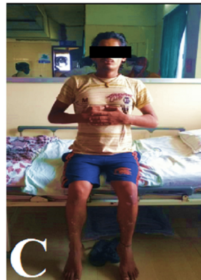
FIGURE 1: Outcome measures and patient performing exercises.