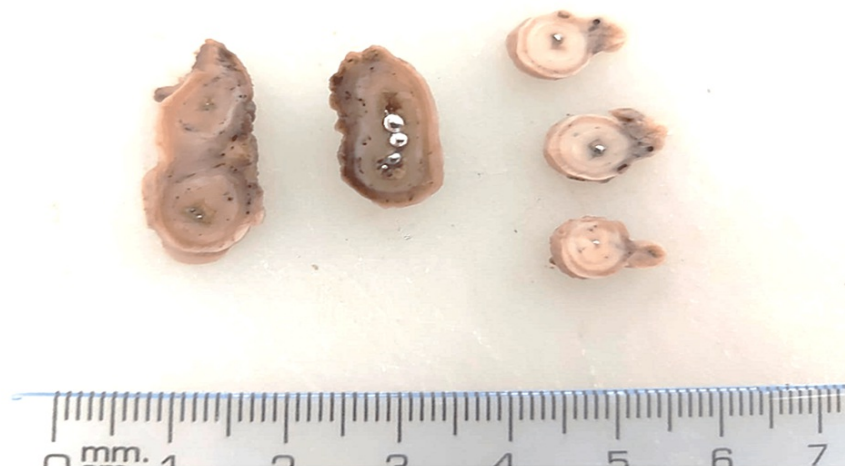
FIGURE 2: Specimen of the appendix after surgery

On the second day after surgery, fecaloid discharge was noted in drains. The patient was taken to the OR, a right colic flexure rupture was found, and a colostomy was performed. Multiple drainages were put in place. Two days after the second surgery, the patient became hypotensive and physical examination showed a rigid abdomen and persistent fecaloid drainage. A new abdominal X-ray showed persistent metal-like radiopaque particles in the GI tract (Figure 1B). The patient underwent a third surgery that showed an ileum perforation; subsequently, an ileostomy was performed. Nevertheless, the patient had poor clinical evolution and developed acute kidney injury and liver dysfunction leading to multiple organ failure. He expired on the third day after the last surgery. Pathology of the appendix showed areas of necrosis and hemorrhage and the presence of retained mercury (Figure 2).