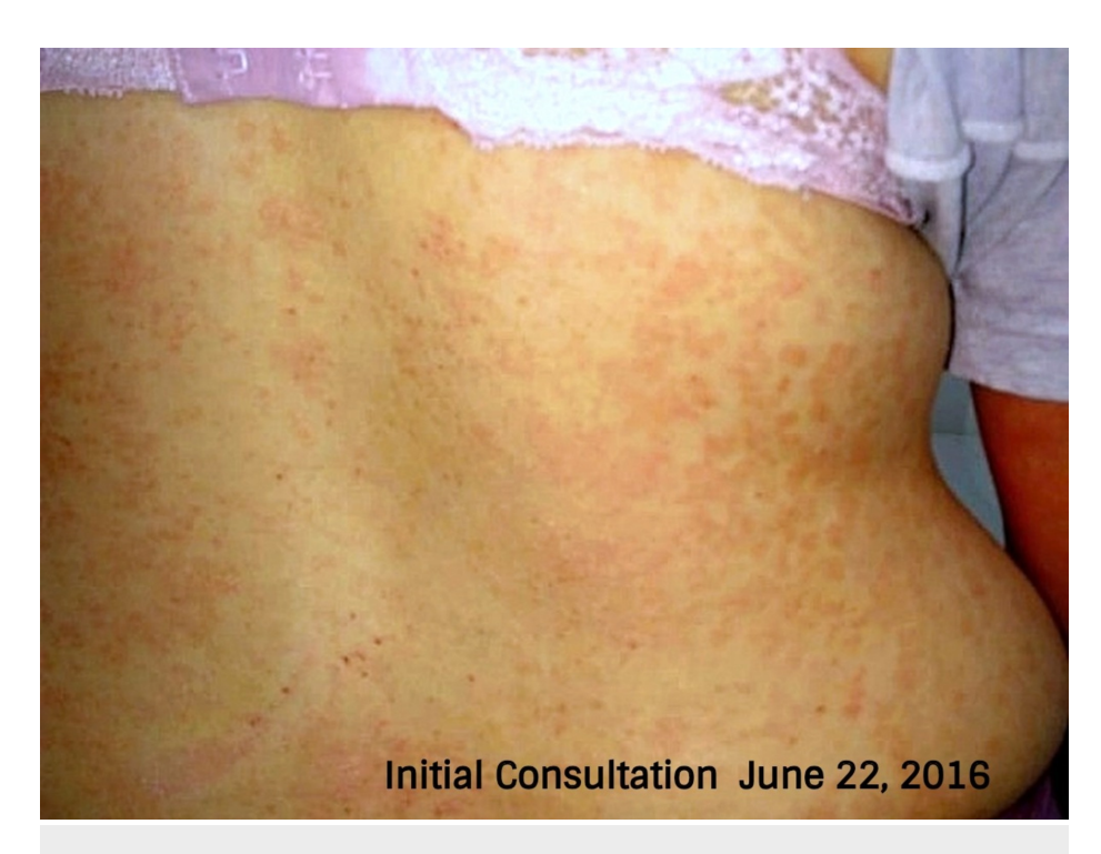
FIGURE 3: Initial consultation photo of the dorsal back

In this photo, we can appreciate the presence of disseminated erythematous plaques throughout the patient's entire body.