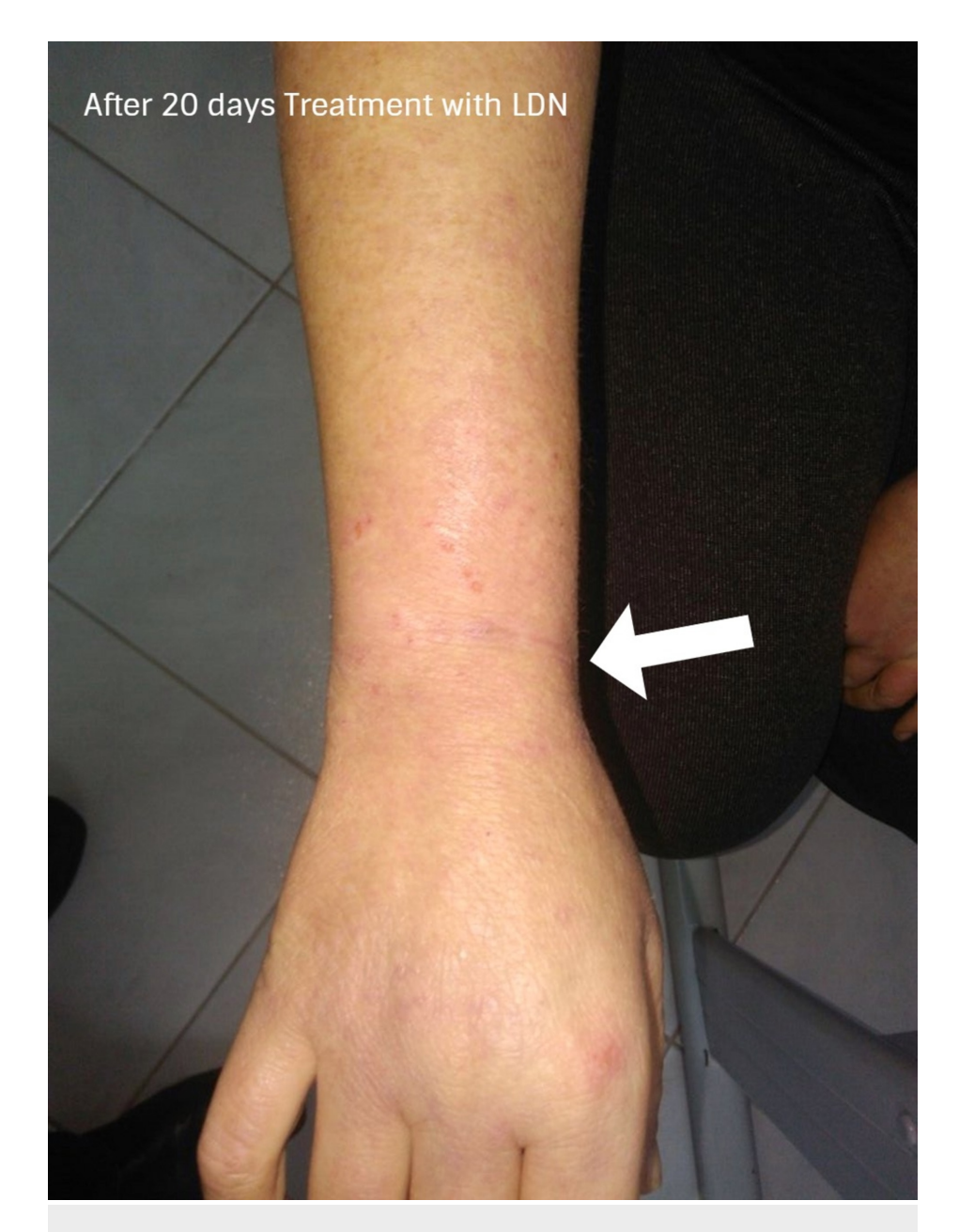
FIGURE 5: After 20 days of treatment with LDN

Significant improvement of bilateral upper extremity edema with an important reduction in the itching sensation obtained with low-dose naltrexone (LDN).