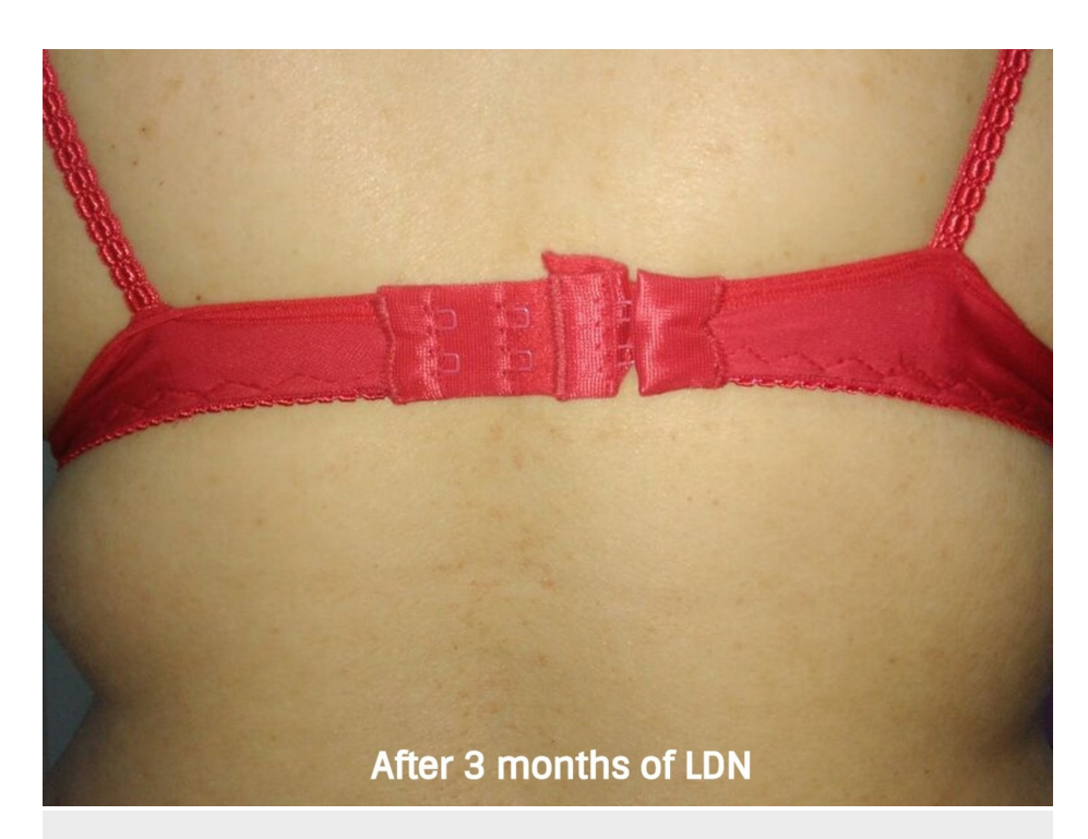
FIGURE 8: After three months of treatment with low dose naltrexone

In this photo, we can notice complete remission of the disease after three months of low-dose naltrexone (LDN) treatment. The patient was symptom-free.