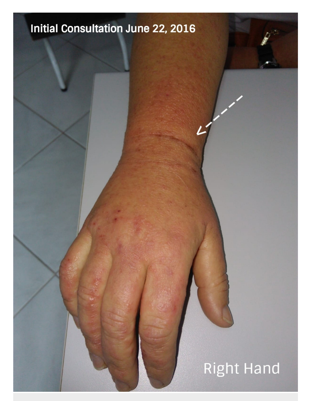
FIGURE 2: Bilateral edema of upper and lower extremities (Initial consultation)

Bilateral edema of the upper and lower extremities was evident, associated with itching and redness, as shown by the arrow. The patient mentioned having some difficulty in making a fist with her hand.