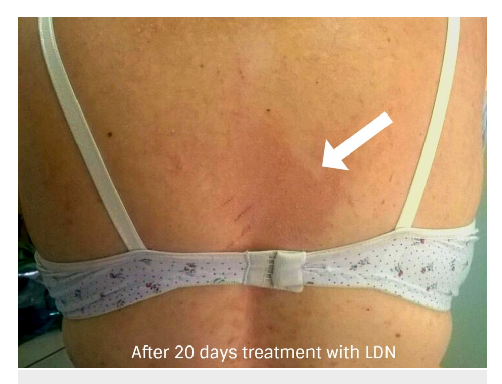
FIGURE 6: After 20 days of treatment with low-dose naltrexone (posterior dorsal back region)

In this photo, we can easily identify an important reduction after 20 days of low-dose naltrexone (LDN) in disseminated erythematous plaque formation. Only a solitary main plaque was found in the central dorsal posterior region of the back as denoted by the arrow.