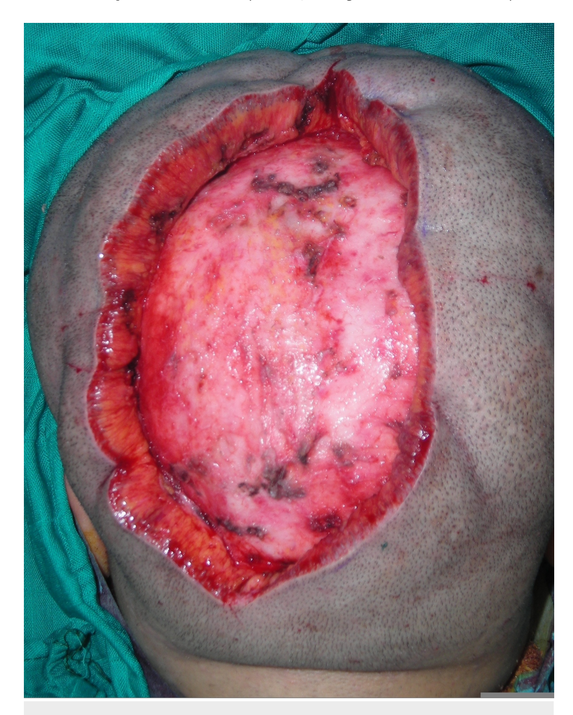
FIGURE 2: Longitudinal excision.

put in the middle of the incision to ensure that the excision will allow for primary closure. The incision could be completed on the other edge allowing for the excision of a specimen 150 mm long and 60 mm wide, and direct closure (Figure 3) could then be achieved easily. The recovery and the follow-up were uneventful. One year later, the surgical outcome was satisfactory.