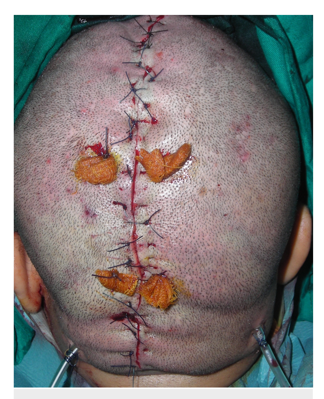
FIGURE 3: Direct closure.