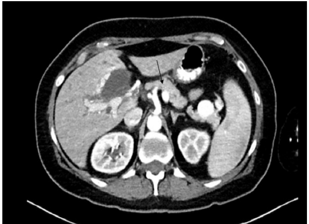
FIGURE 1: Computed tomography of abdomen with contrast suggestive of portal vein thrombosis, with arrow showing a markedly dilated splenic vein

The initial laboratory work-up revealed markedly elevated total bilirubin (18.1 mg/dl) and alkaline phosphatase (475 unit/liter). An abdominal ultrasound revealed marked extrahepatic biliary duct dilatation. Magnetic resonance cholangiopancreatography (MRCP) showed extrahepatic and intrahepatic biliary ductal dilatation due to short segment stenosis of the distal common bile duct. A computed tomography (CT) scan of the abdomen with intravenous contrast demonstrated a large tortuous splenic vein as well as numerous dilated veins extending into the region of the porta hepatis (Figure 1). Bilirubin and alkaline phosphatase levels rapidly improved with intravenous hydration, and the patient was discharged with a plan for follow-up MRCP (Figure 2). Two weeks later, she presented with recurrence of her jaundice. ERCP was performed, which showed dilation of the common bile duct and intrahepatic ducts. A plastic stent was placed, after which the total bilirubin and alkaline phosphatase levels decreased. She then developed cholangitis and underwent ERCP with cholangioscopy (Figure 3). This showed extrinsic compression at the mid bile duct from the portal venous cavernoma, establishing the diagnosis of portal biliopathy.