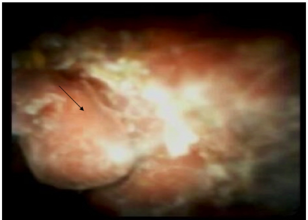
FIGURE 3: Cholangioscopy showing biliary compression with