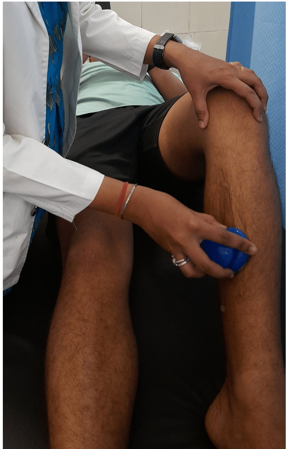
FIGURE 1: Showed that the cupping therapy was given to the patient with a shin splint.