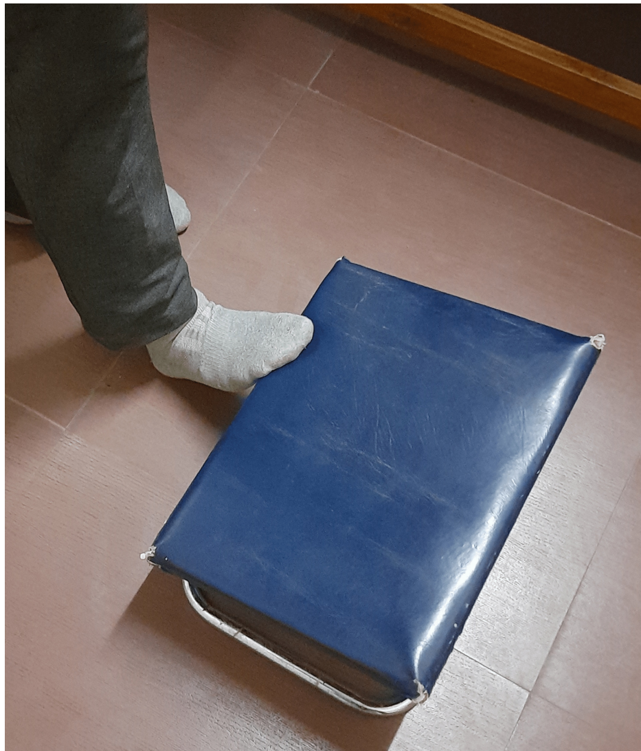
FIGURE 2: Shows the self-stretching for TA.