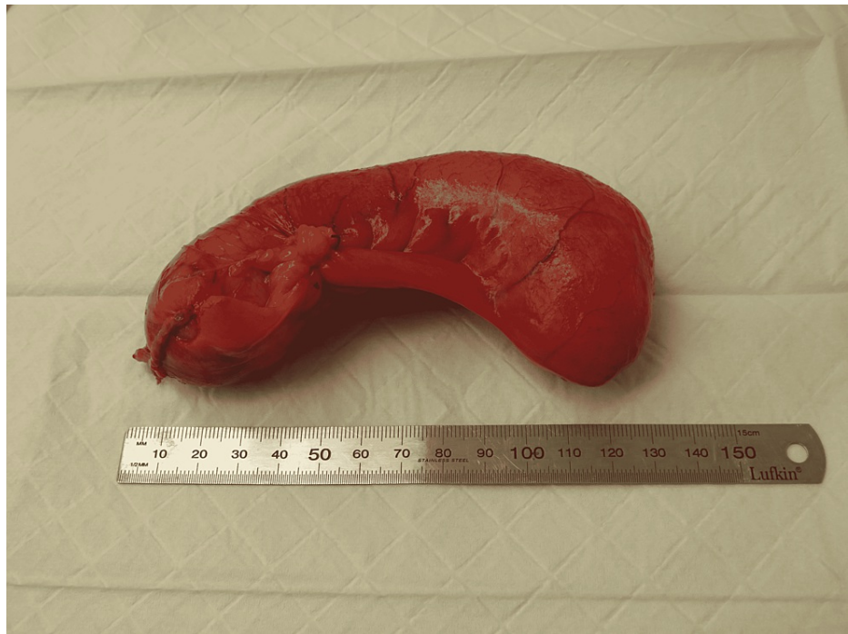
FIGURE 2: Intact removed appendiceal specimen.