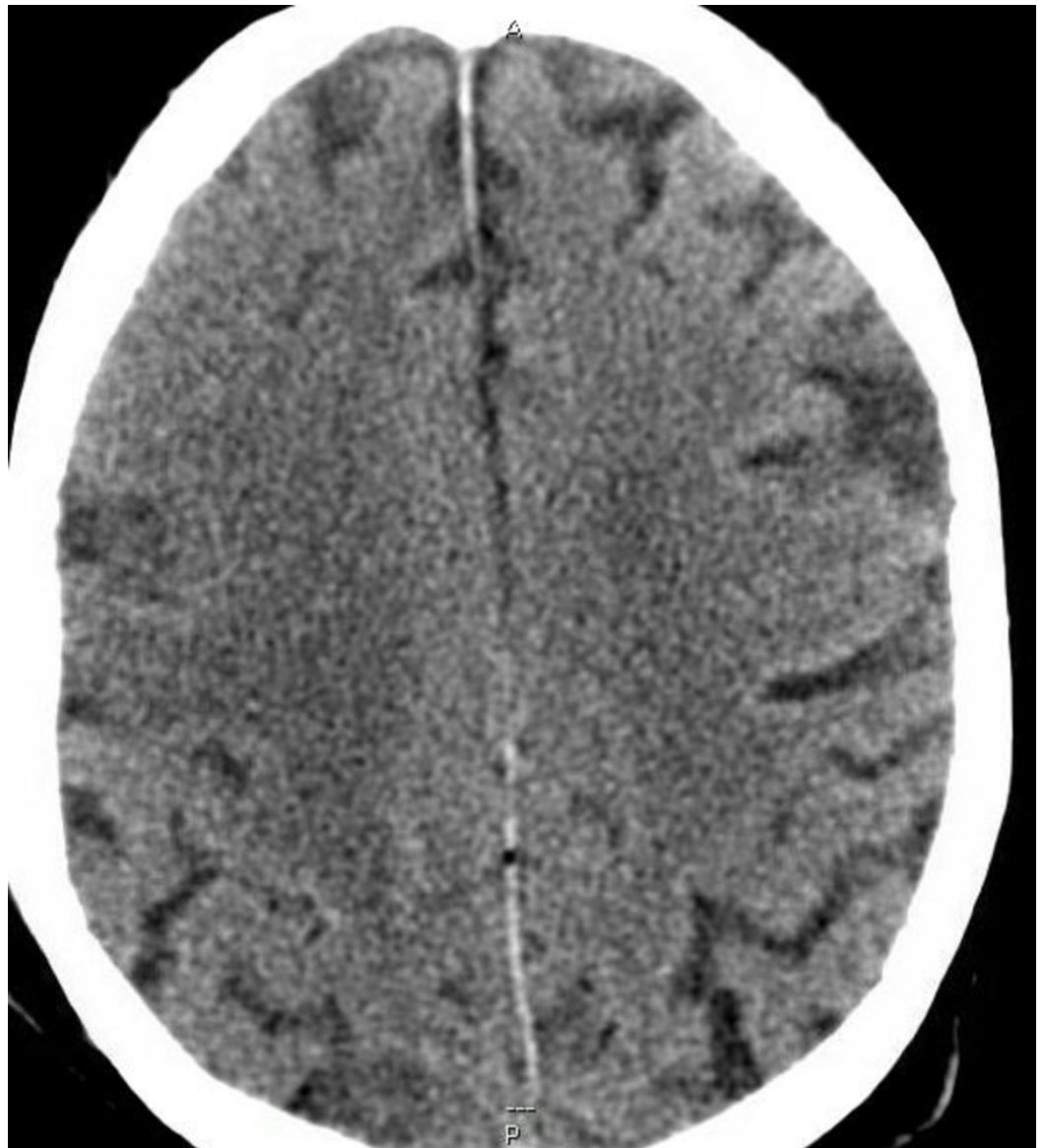
FIGURE 2: Area of hypoattenuation in the right frontoparietal lobe

The patient was admitted to the neurological intensive care unit (NICU) and was not given intravenous thrombolytics for the suspected stroke as he had sustained moderate bleeding with the bronchoscopy. Later that night, the patient had generalized tonic-clonic seizures that were aborted with benzodiazepines and levetiracetam. The patient then underwent repeat CT and magnetic resonance imaging (MRI) scan of the brain with and without contrast. The CT scan showed an area of hypoattenuation in the right frontoparietal lobe with a loss of gray-white matter differentiation concerning for an infarction in the right MCA territory without evidence of hemorrhagic conversion (Figure 2).