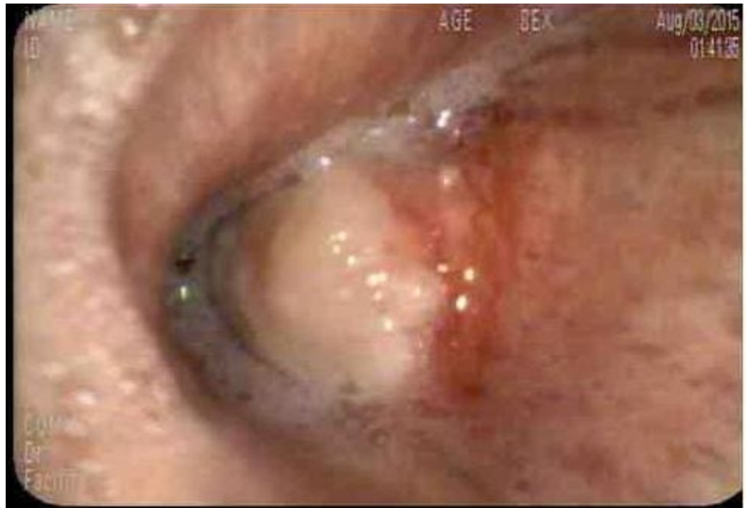
FIGURE 1: Large endobronchial lesion in the bronchus intermedius completely obstructing the right middle lobe and the right lower lobe

Flexible bronchoscopy was performed on the patient in the semi-recumbent position under moderate sedation during which the patient received 200 mcg of fentanyl and 7 mg of midazolam. The procedure revealed a large endobronchial lesion in the bronchus intermedius that completely obstructed the RML and the RLL (Figure 1). APC at 30 watts and gas flow at 0.8 liters/minute were applied to the tumor, followed by blunt dissection of devitalized tissues with cupped and rat tooth forceps. The blunt dissection resulted in moderate bleeding that was controlled with cauterization. The patient tolerated the four-hour procedure well and was then transferred to the recovery room.