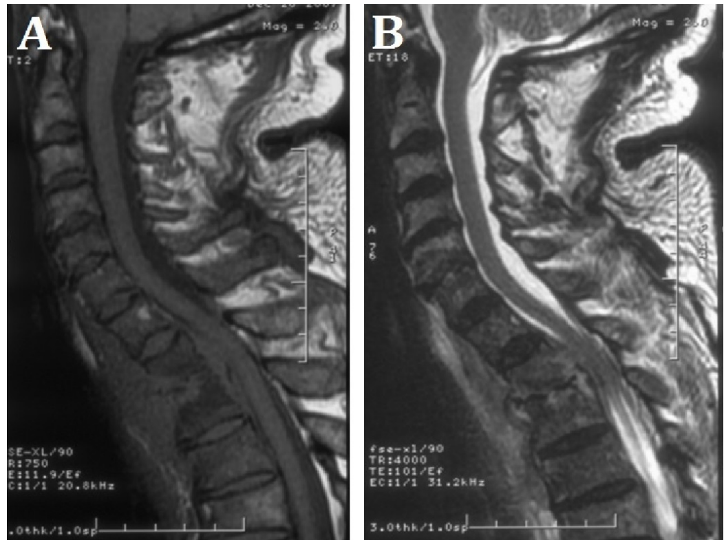
FIGURE 2: Preoperative MRI Imaging

Preoperative sagittal (A) T1- and (B) T2-weighted MRI showing discitis and osteomyelitis at T1 and T2, anterior epidural collection extending from C7-T2, and severe canal stenosis and cord compression.