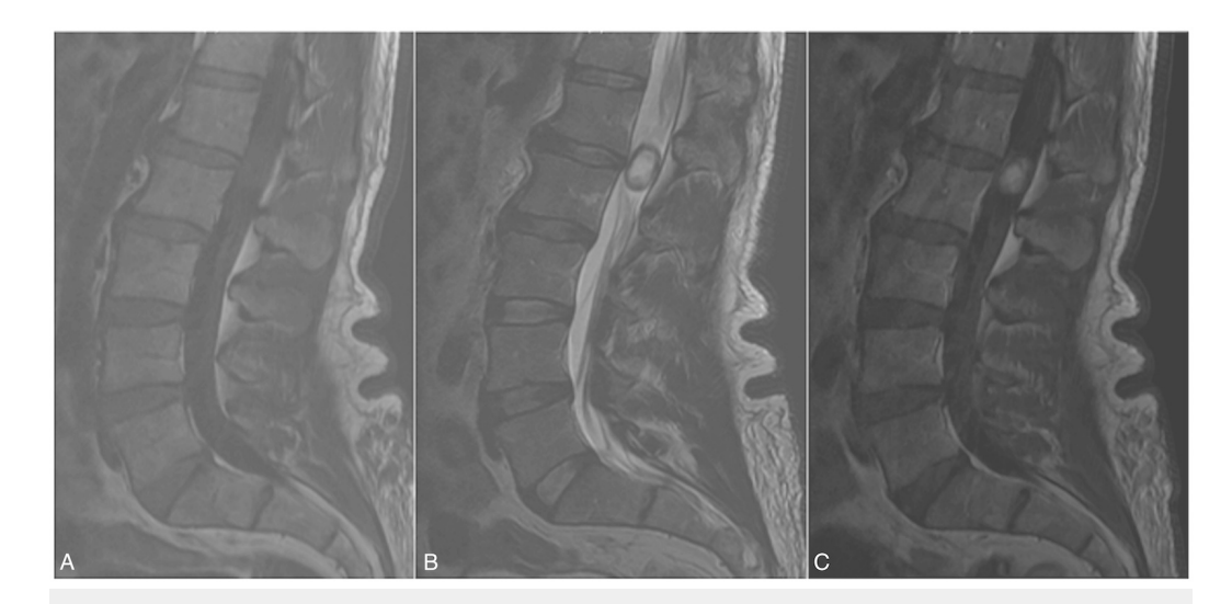
FIGURE 1: Magnetic Resonance Imaging (MRI) of the Lumbar Spine

Neuroimaging with an MRI of the lumbar spine with and without contrast demonstrated an intradural mass at the level of the conus measuring 1.4 x 1.1 x 2.2 cm with heterogeneous contrast enhancement (Figure 1). Small disc herniations were also noted at L2-3 and L4-5.